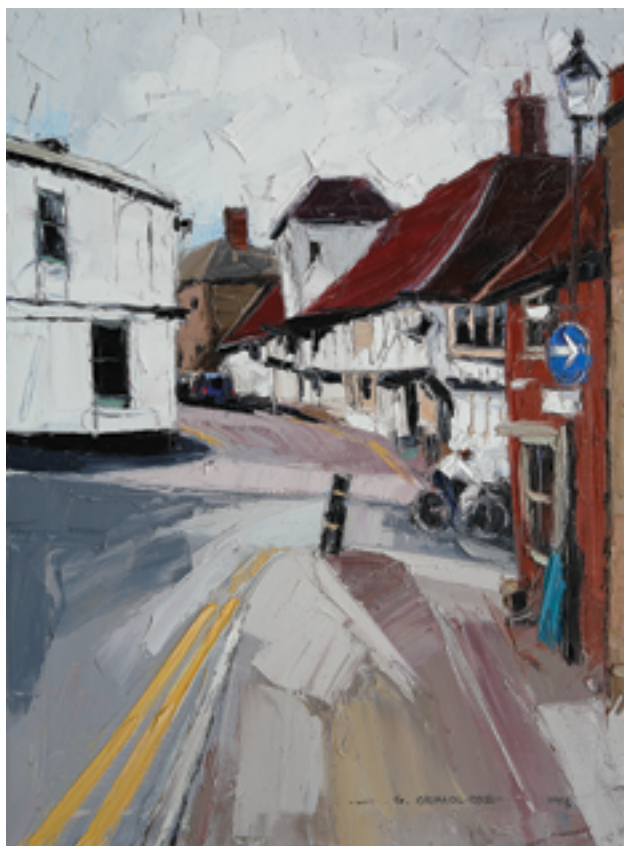
Castle Street, Saffron Walden. Oil on canvas, 2013. 61 x 46 cm