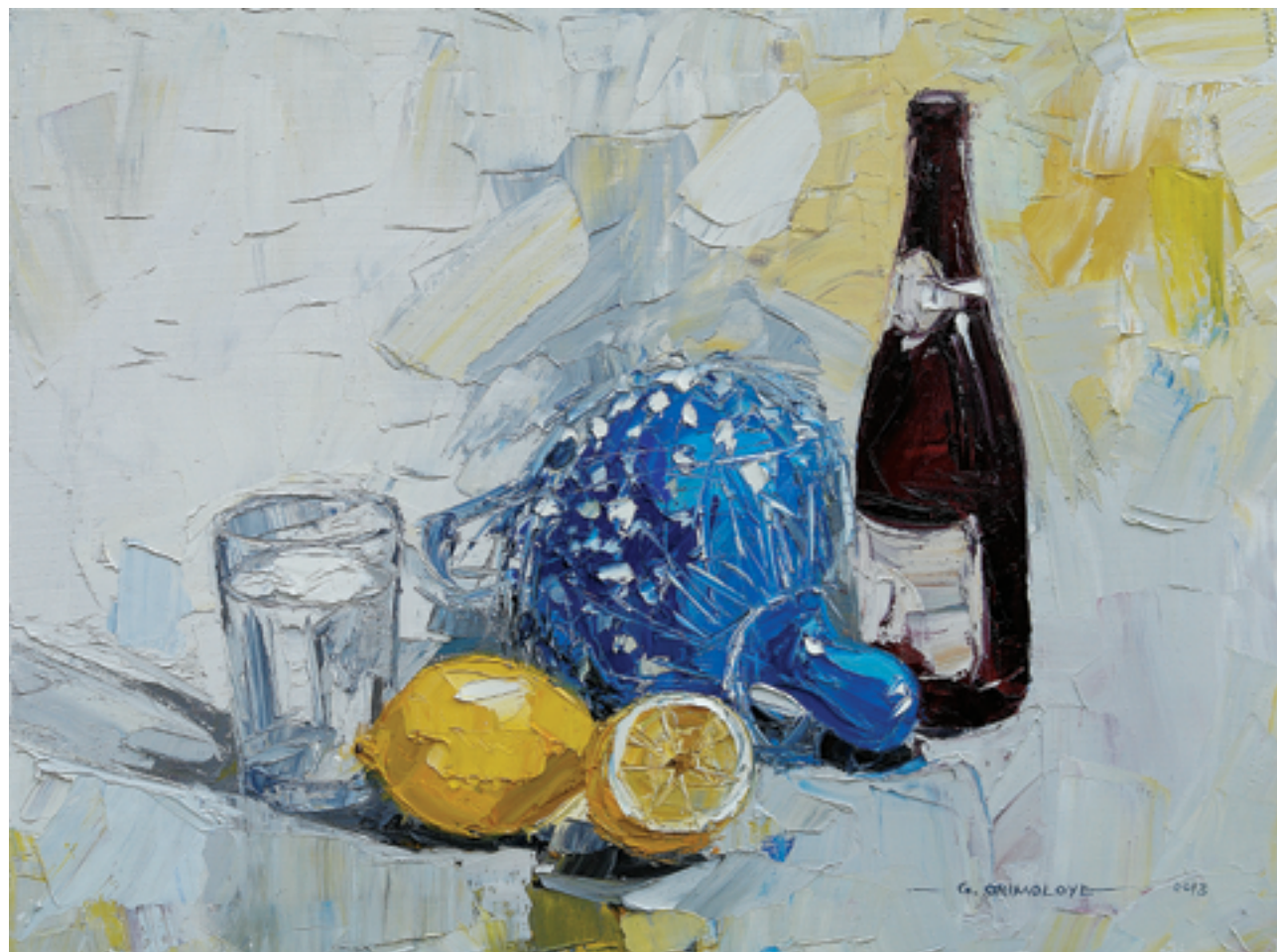
Shekere, lemons and glass of water. Oil on canvas, 2013. 61 x 46 cm