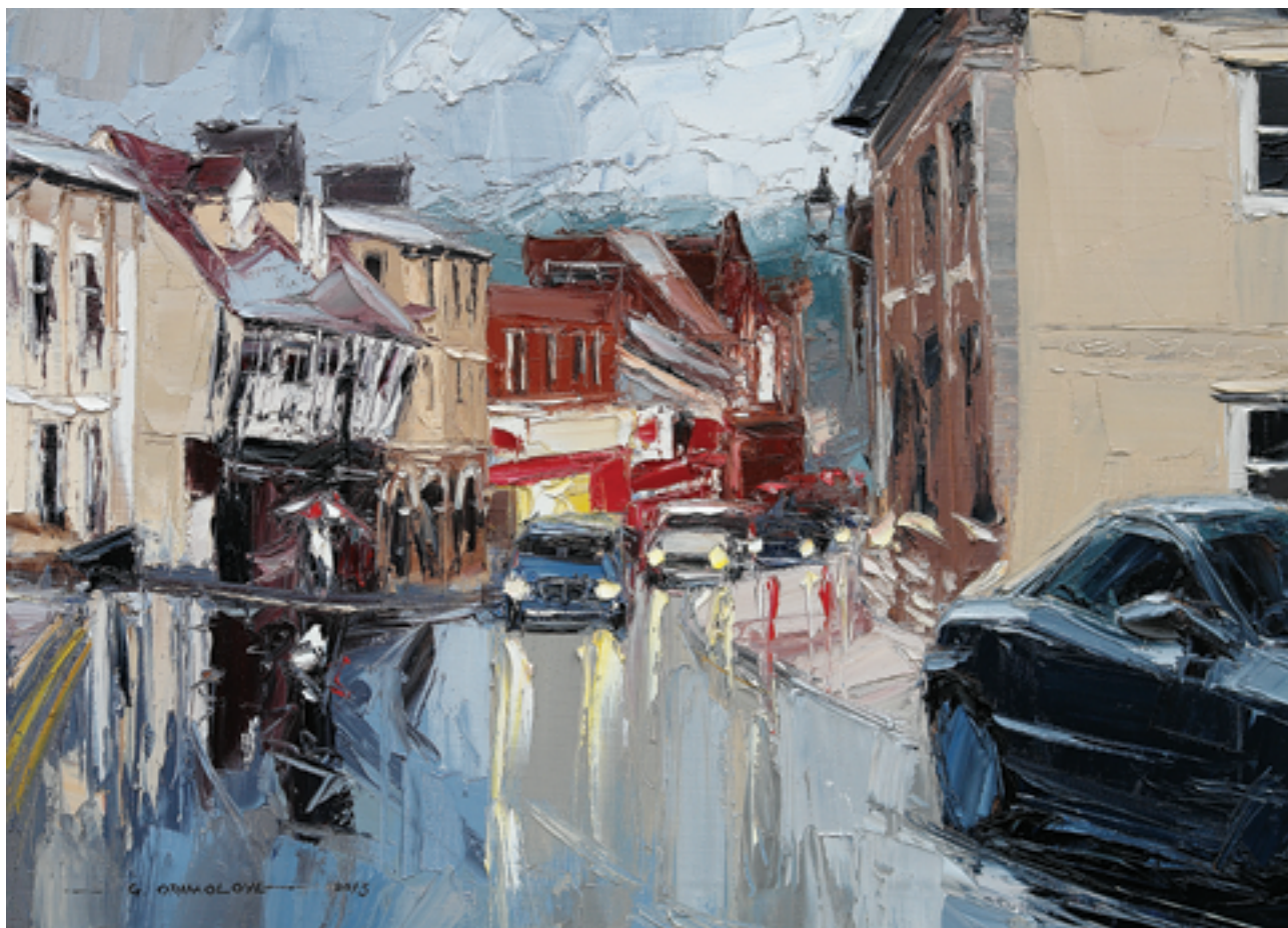
High Street in the rain, Saffron Walden. Oil on canvas, 2013. 61 x 46 cm