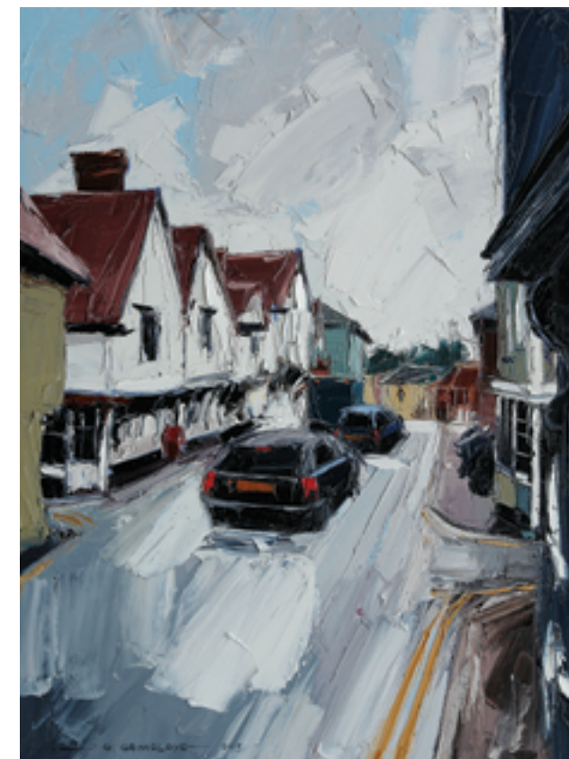
Church Street, Saffron Walden. Oil on canvas, 2013. 61 x 46 cm