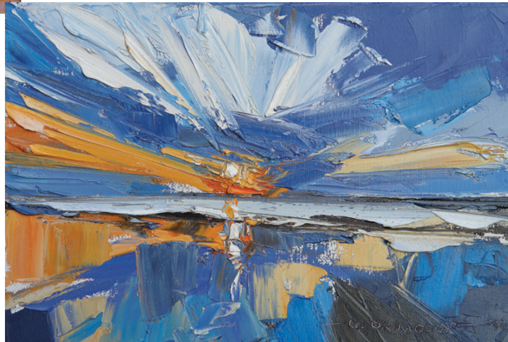
Old Hunstanton Beach, Norfolk. Oil on canvas, 2014. 36 x 26 cm