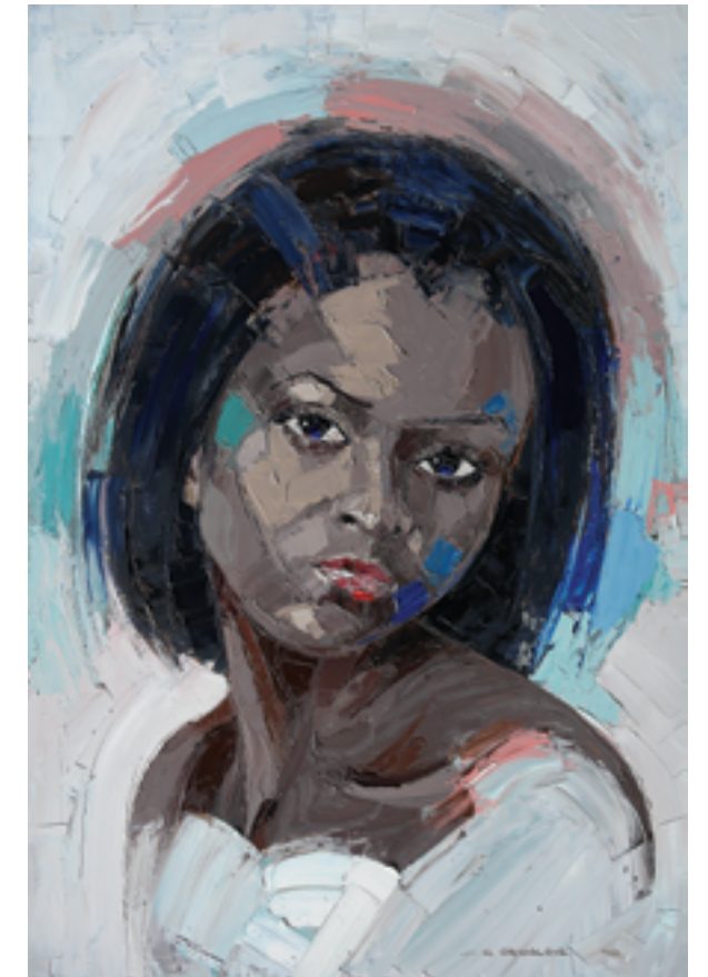
Oju (6). Oil on board, 2012. 123 x 82 cm