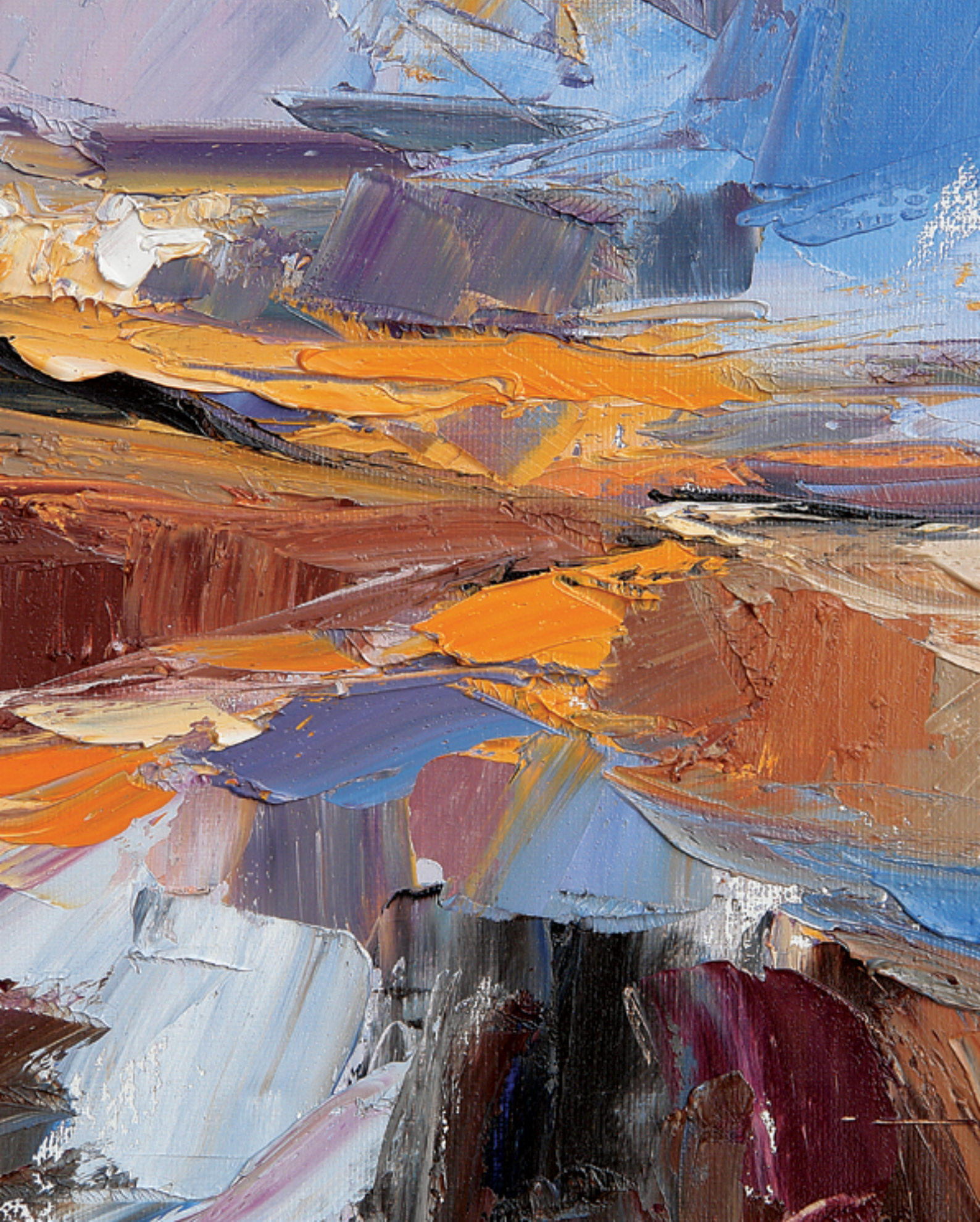
GBENGA ORIMOLOYE solo exhibition at the saffron walden gallery