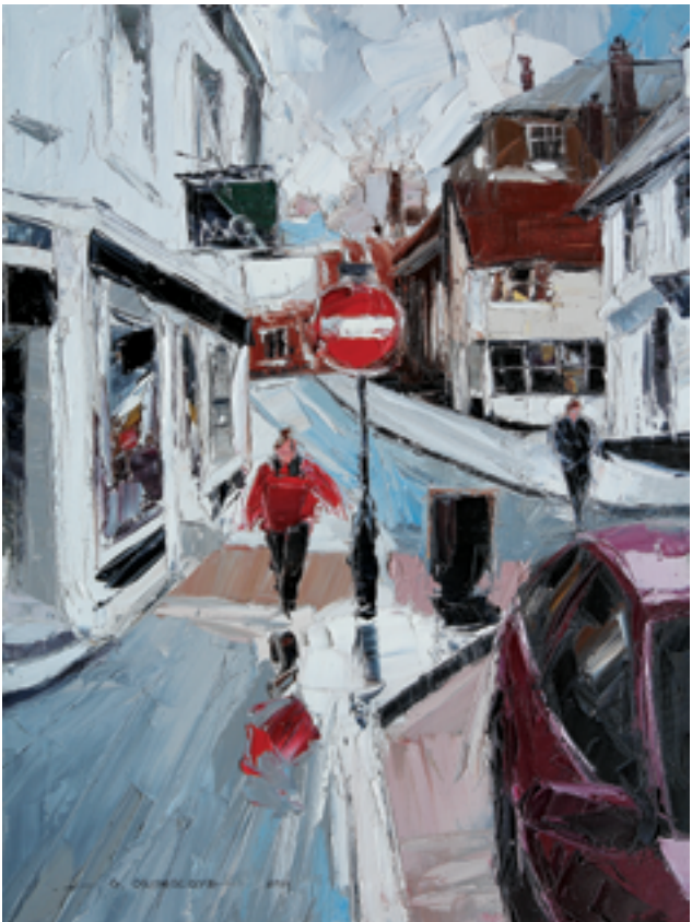
Market Hill (from Market Square), Saffron Walden. Oil on canvas, 2013. 61 x 46 cm