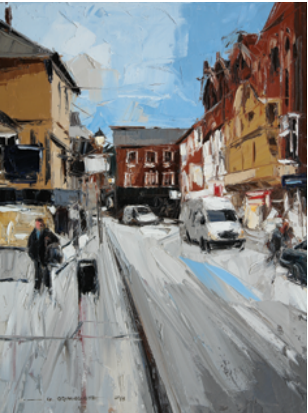
King Street, Saffron Walden. Oil on canvas, 2013. 61 x 46 cm