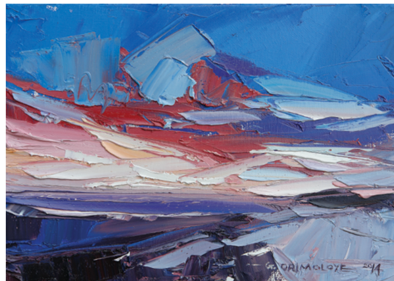
Chesil Beach sunset, Dorset. Oil on canvas, 2014. 36 x 26 cm