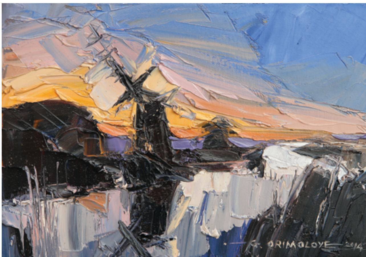
Brograve Mill, Norfolk. Oil on canvas, 2014. 36 x 26 cm