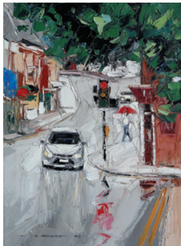
Early Morning Rain, High Street, Saffron Walden. Oil on canvas, 2013. 61 x 46 cm