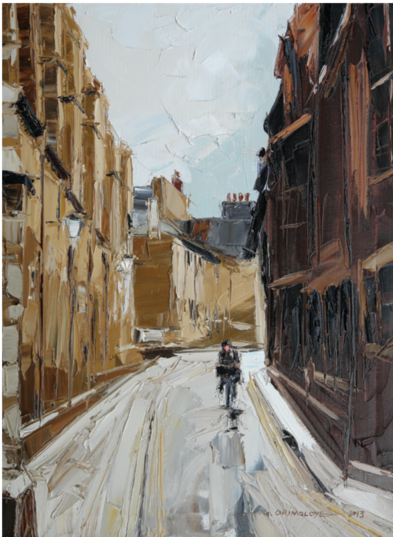
Cyclist on Trinity Lane, Cambridge. Oil on canvas, 2013. 61 x 46 cm