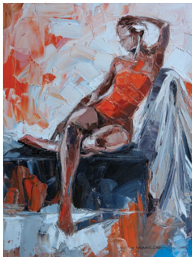
Girl in orange. Oil on canvas, 2013. 61 x 46 cm