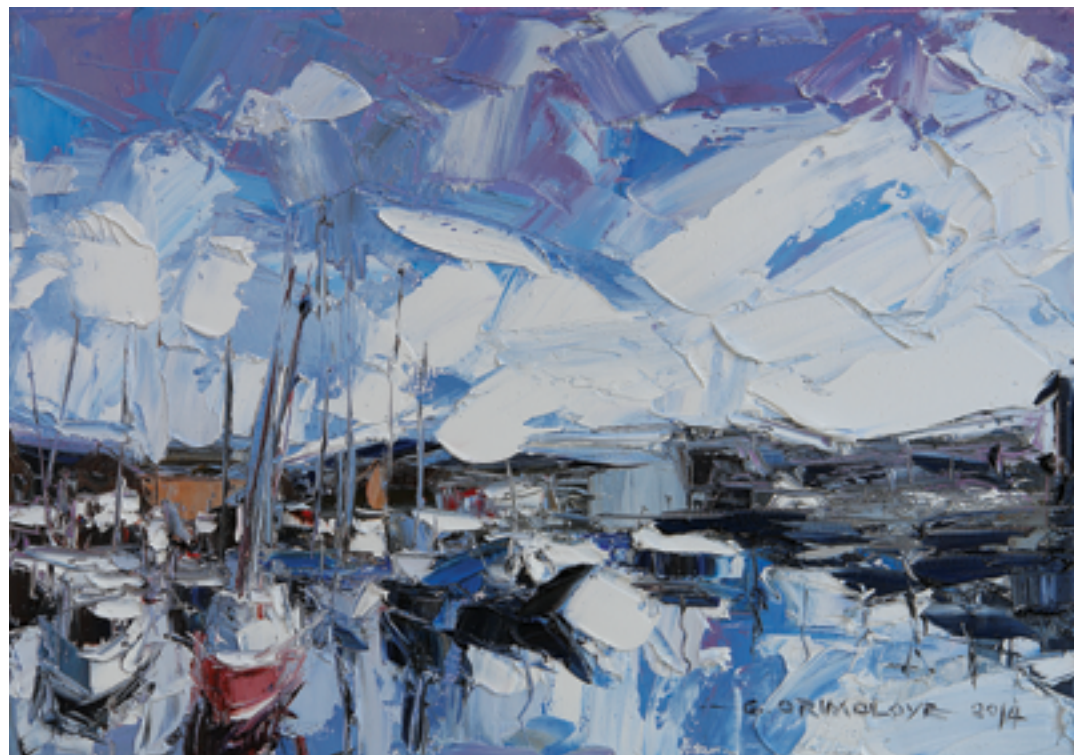
Broadchurch Harbour, West Bay, Dorset. Oil on canvas, 2014. 36 x 26 cm