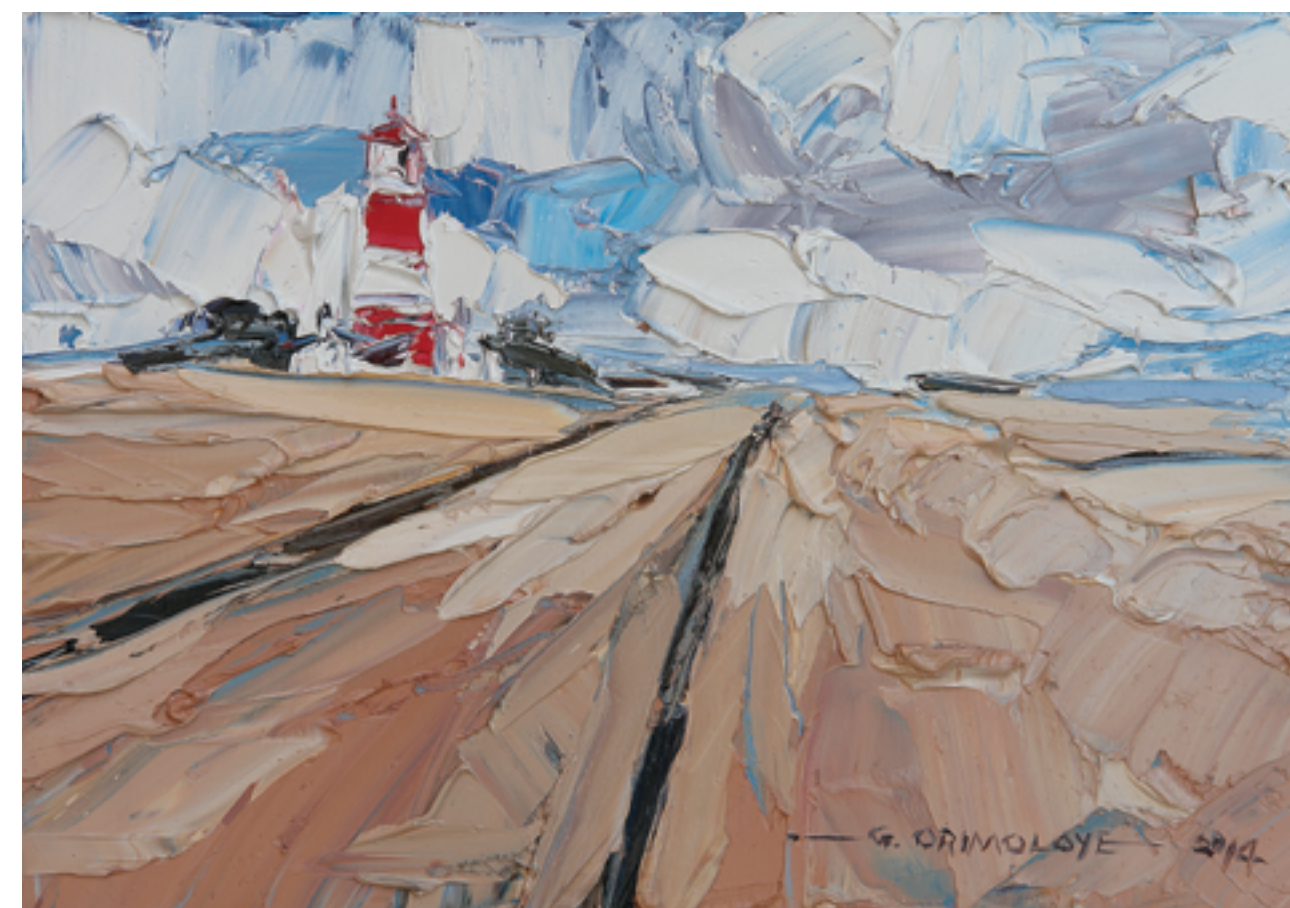
Field, Happisburgh, Norfolk. Oil on canvas, 2014. 36 x 26 cm