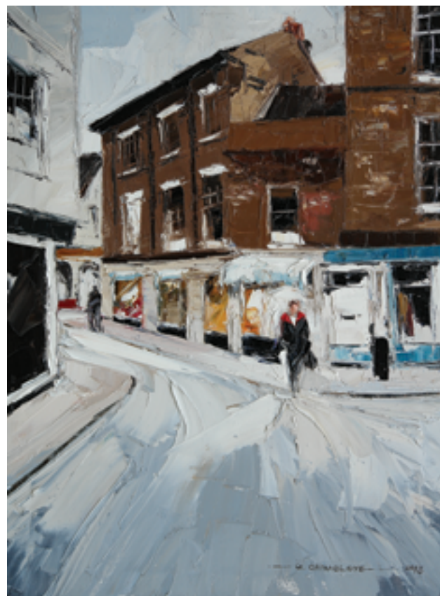
Cross Street, Saffron Walden. Oil on canvas, 2013. 61 x 46 cm