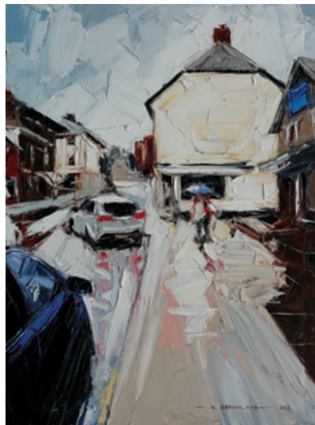
George Street, Saffron Walden. Oil on canvas, 2013. 61 x 46 cm