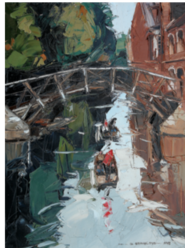
Mathematical Bridge and Queens' College. Oil on canvas, 2013. 61 x 46 cm