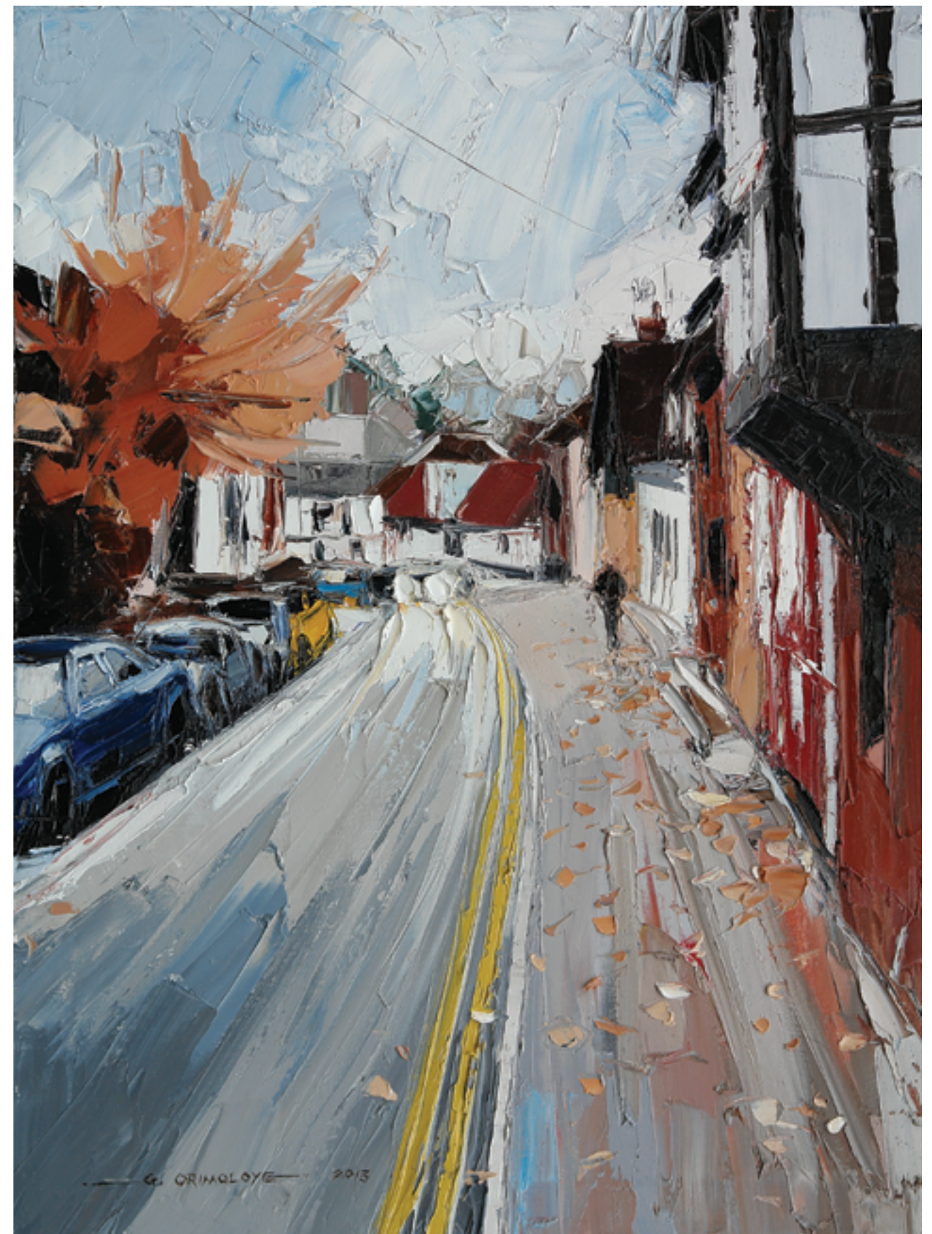
Upper Castle Street, Saffron Walden. Oil on canvas, 2013. 61 x 46 cm