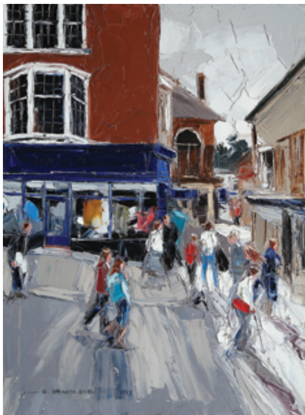
April morning, King Street, Saffron Walden. Oil on canvas, 2013. 61 x 46 cm