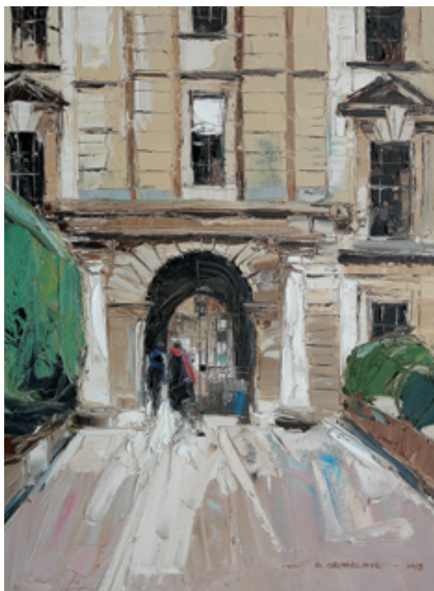
Clare College from The Backs. Oil on canvas, 2013. 61 x 46 cm