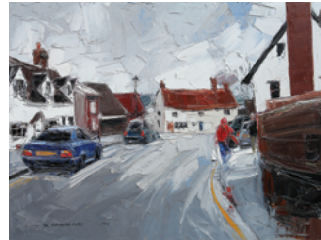
Museum Street, Saffron Walden. Oil on canvas, 2013. 62 x 46 cm