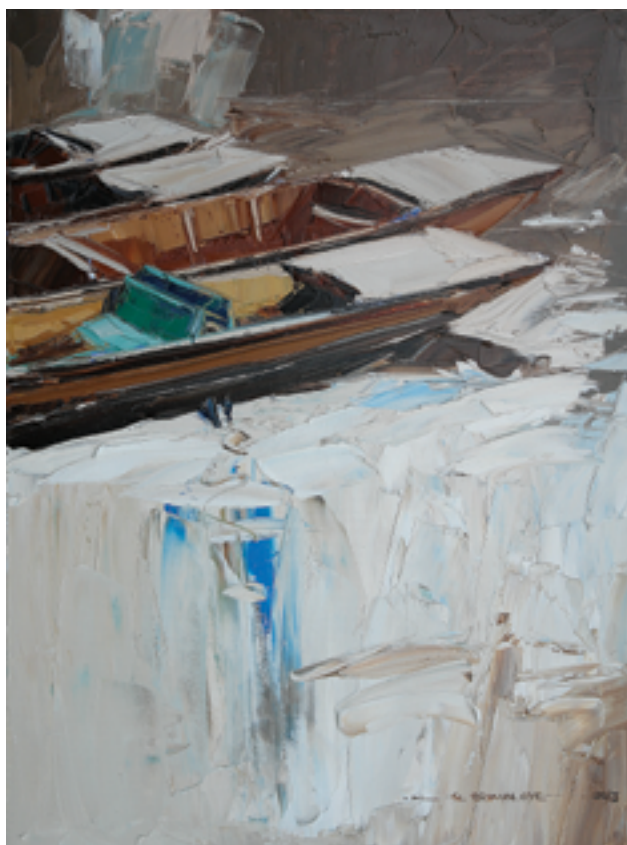
Punts on the Cam. Oil on canvas, 2013. 61 x 46 cm