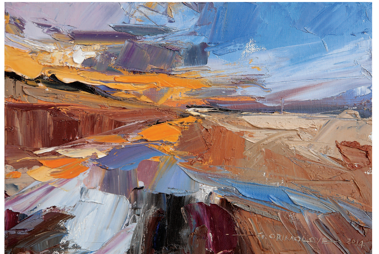
Caister Beach, Caister-on-Sea, Norfolk. Oil on canvas, 2014. 36 x 26 cm