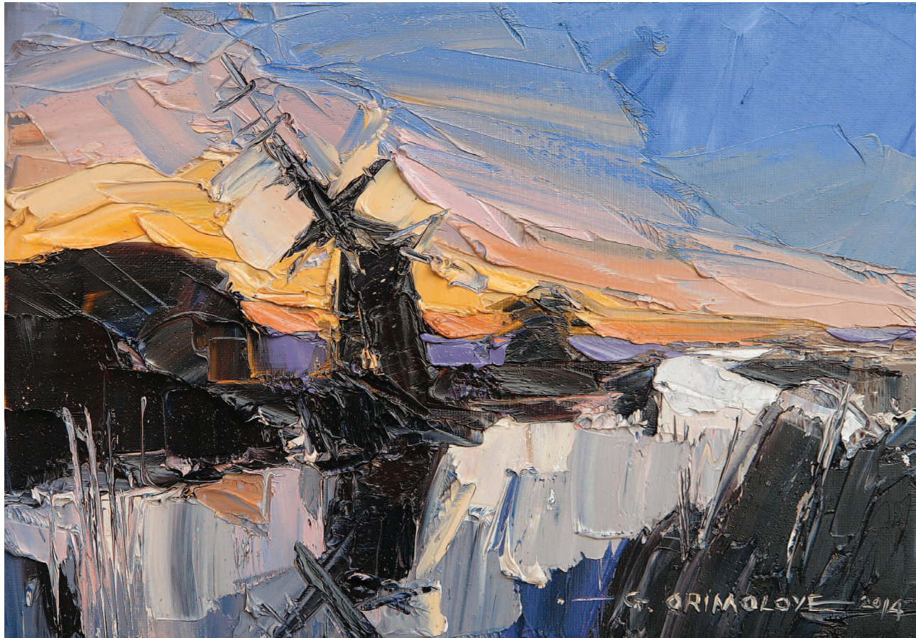
Brograve Mill, Norfolk. Oil on canvas, 2014. 36 x 26 cm