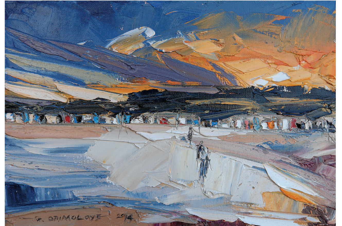
Wells next-the-Sea, Norfolk. Oil on canvas, 2014. 36 x 26 cm