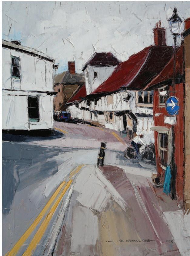
Castle Street, Saffron Walden. Oil on canvas, 2013. 61 x 46 cm