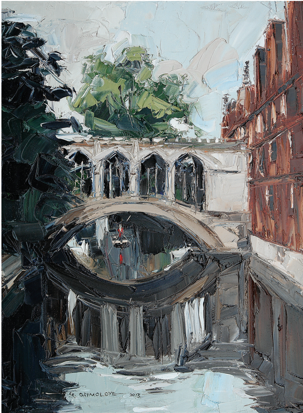
Bridge of Sighs and St John's, Cambridge. Oil on canvas, 2013. 62 x 46 cm