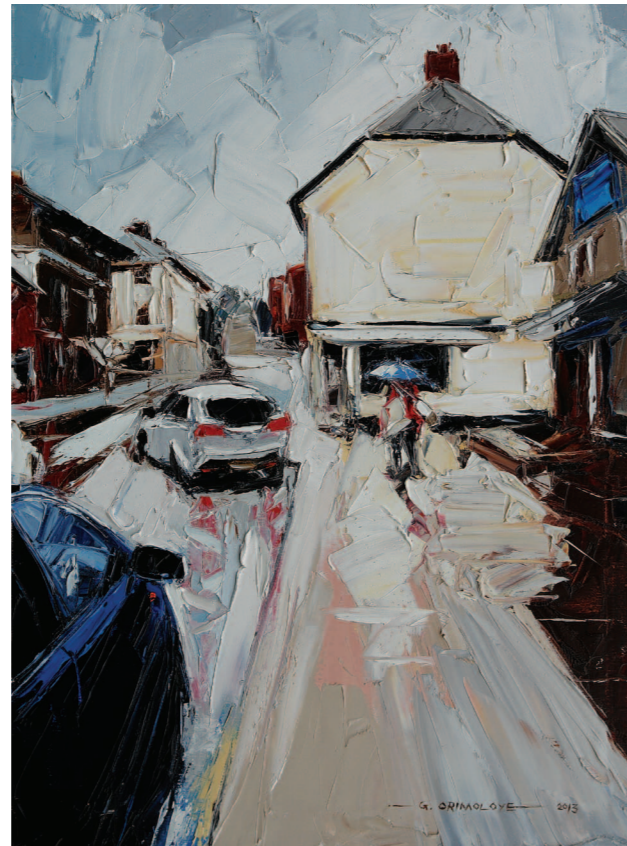
George Street, Saffron Walden. Oil on canvas, 2013. 61 x 46 cm