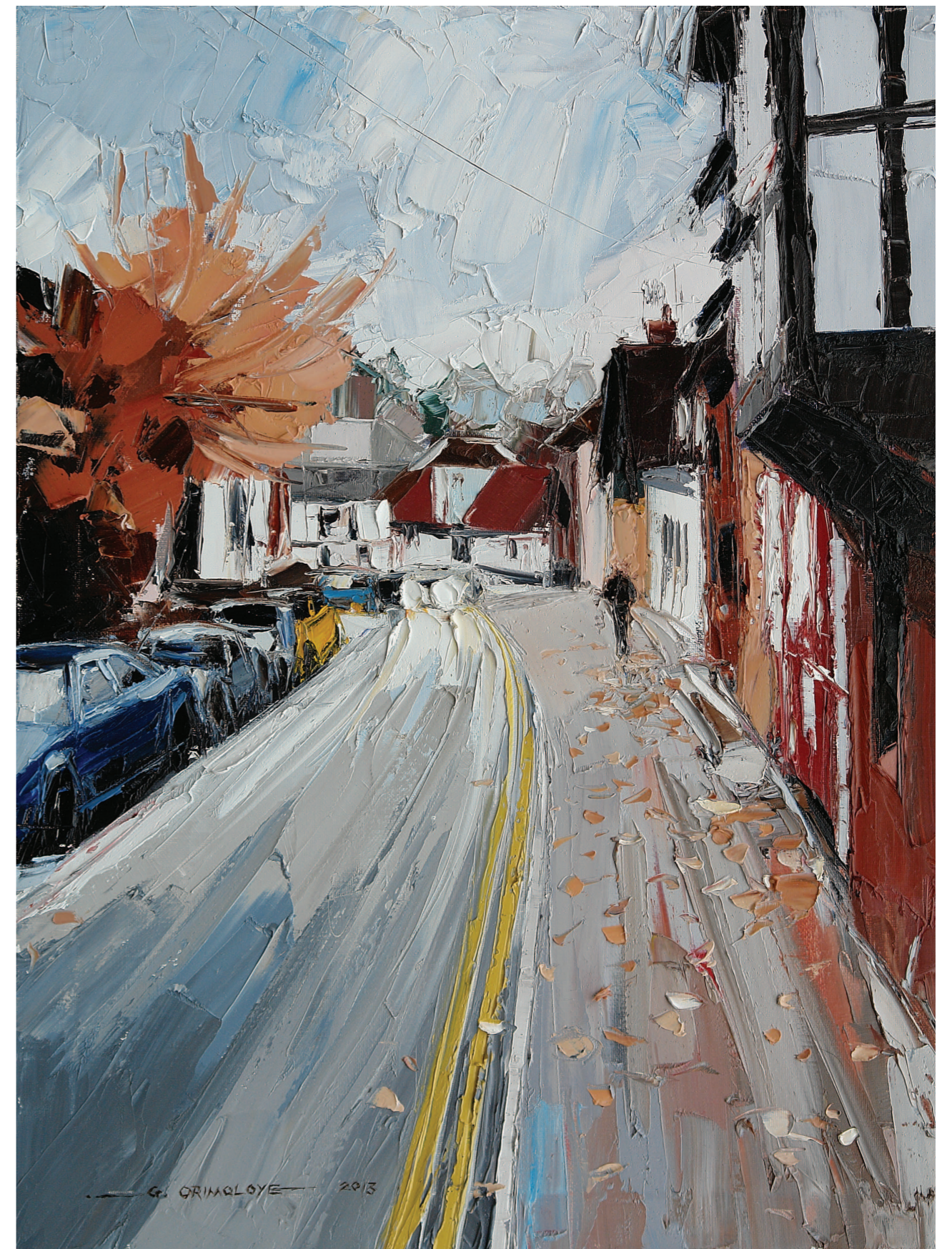
Upper Castle Street, Saffron Walden. Oil on canvas, 2013. 61 x 46 cm