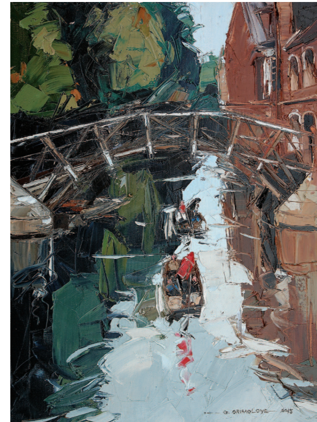
Mathematical Bridge and Queens' College. Oil on canvas, 2013. 61 x 46 cm