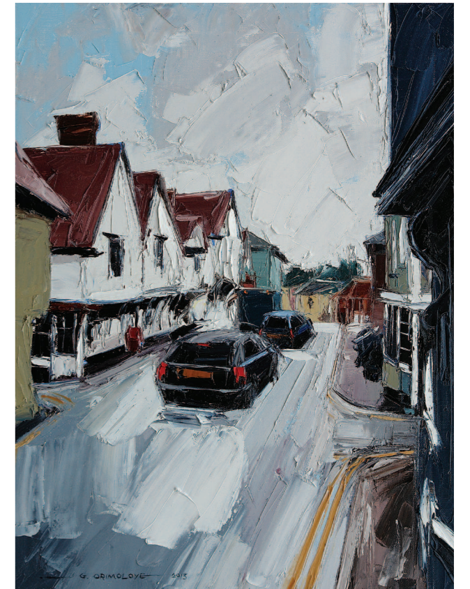
Church Street, Saffron Walden. Oil on canvas, 2013. 61 x 46 cm