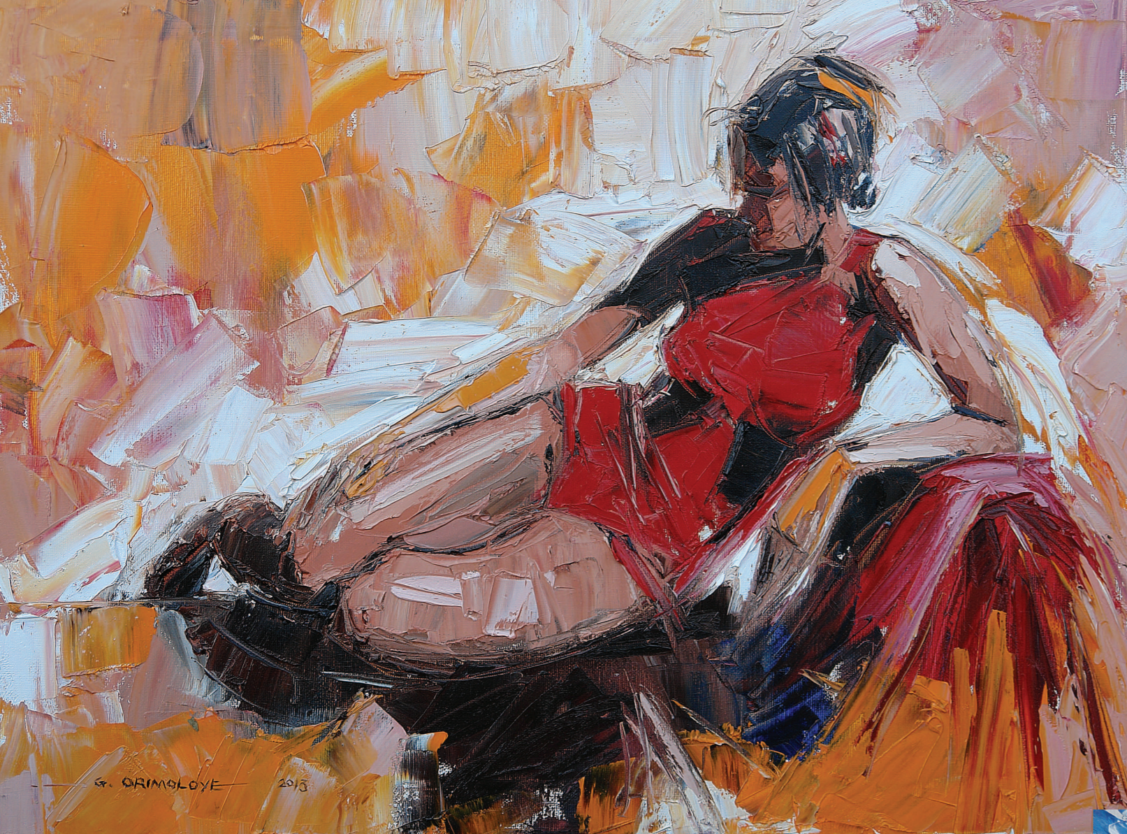
Girl in red. Oil on canvas, 2013. 61 x 46 cm