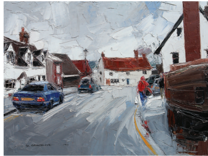
Museum Street, Saffron Walden. Oil on canvas, 2013. 62 x 46 cm