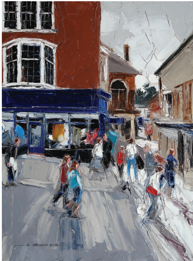
April morning, King Street, Saffron Walden. Oil on canvas, 2013. 61 x 46 cm