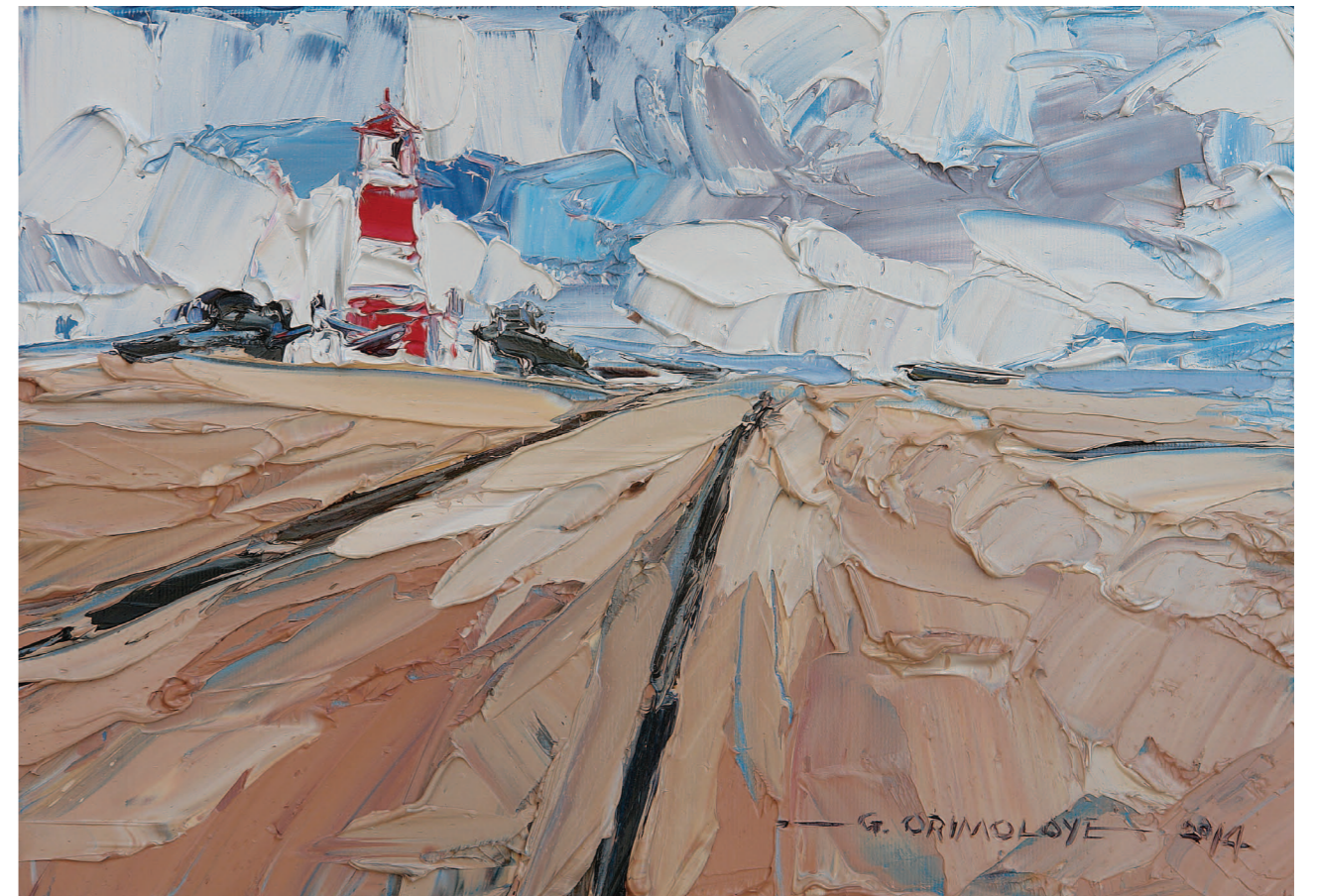
Field, Happisburgh, Norfolk. Oil on canvas, 2014. 36 x 26 cm