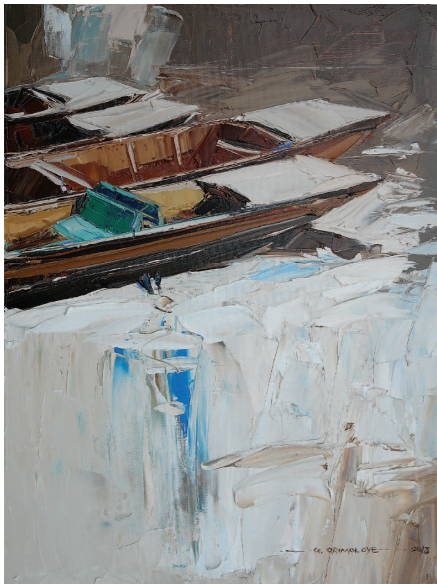
Punts on the Cam. Oil on canvas, 2013. 61 x 46 cm