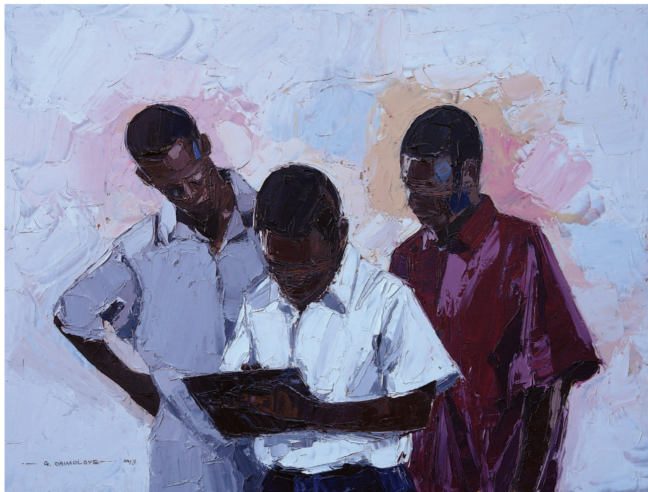
Social networking. Oil on board, 2013. 82 x 62 cm

As an artist I am fascinated by mankind's inherent transient nature, along with realities which can stand as allegories of life. This perhaps best explains the figurative and narrative that is often prominent in my work.