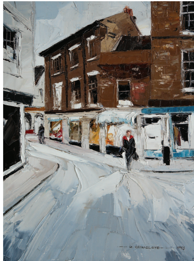
Cross Street, Saffron Walden. Oil on canvas, 2013. 61 x 46 cm