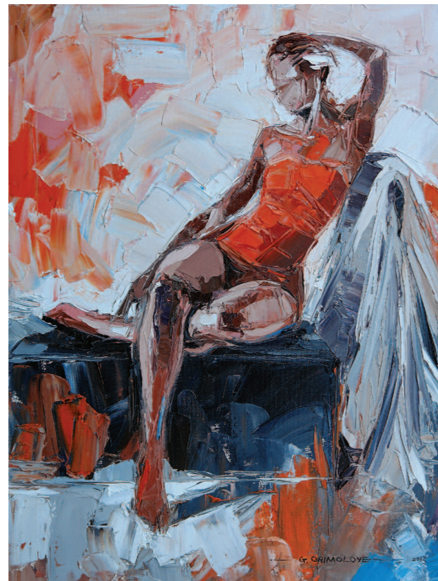
Girl in orange. Oil on canvas, 2013. 61 x 46 cm