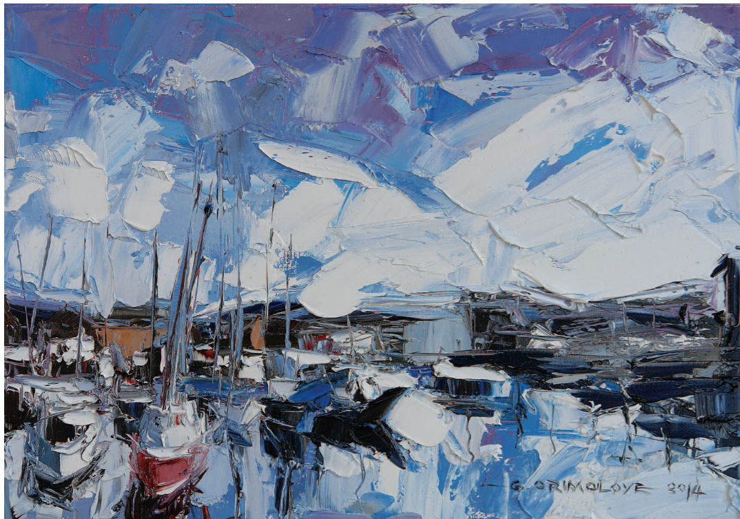
Broadchurch Harbour, West Bay, Dorset. Oil on canvas, 2014. 36 x 26 cm