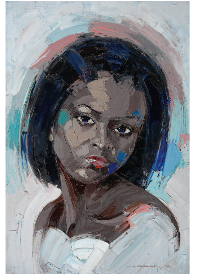
Oju (6). Oil on board, 2012. 123 x 82 cm