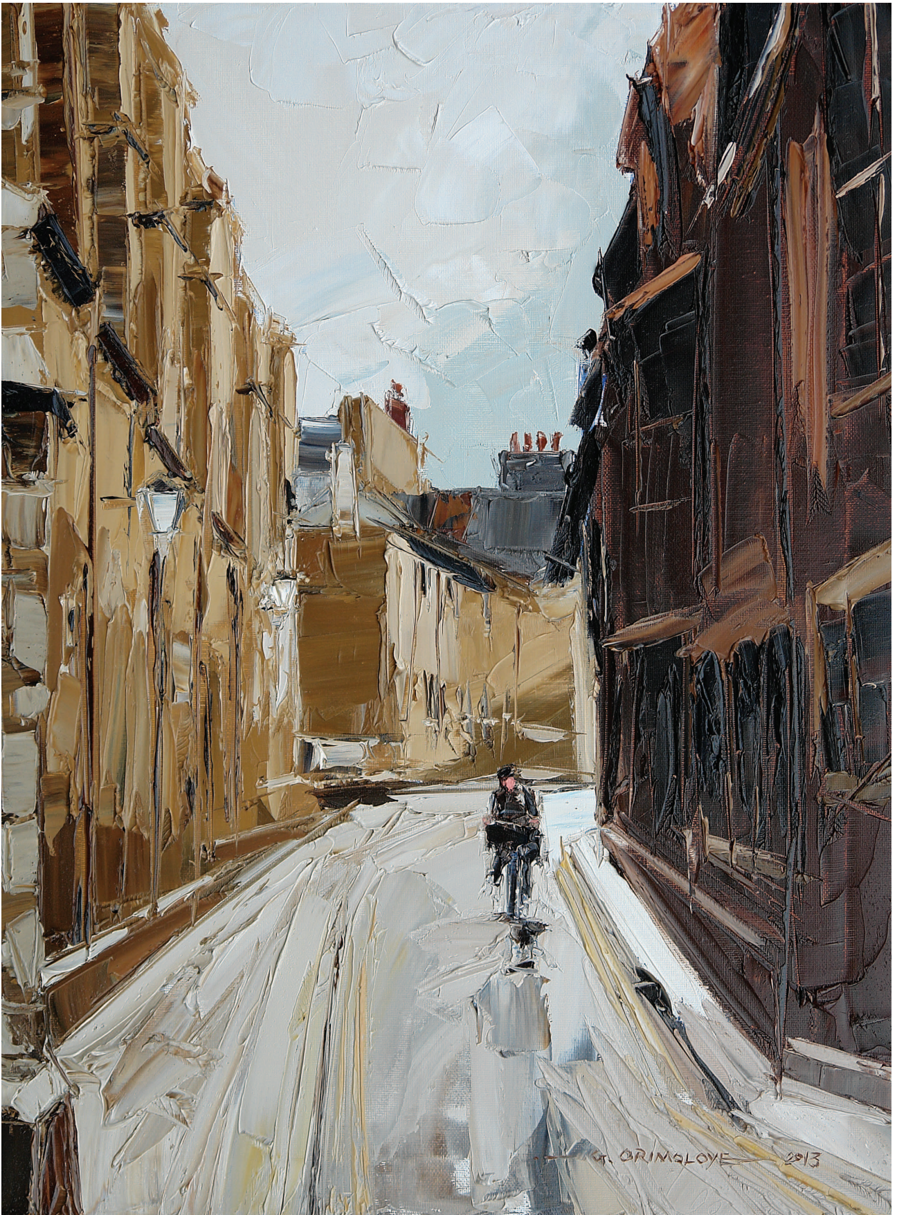
Cyclist on Trinity Lane, Cambridge. Oil on canvas, 2013. 61 x 46 cm