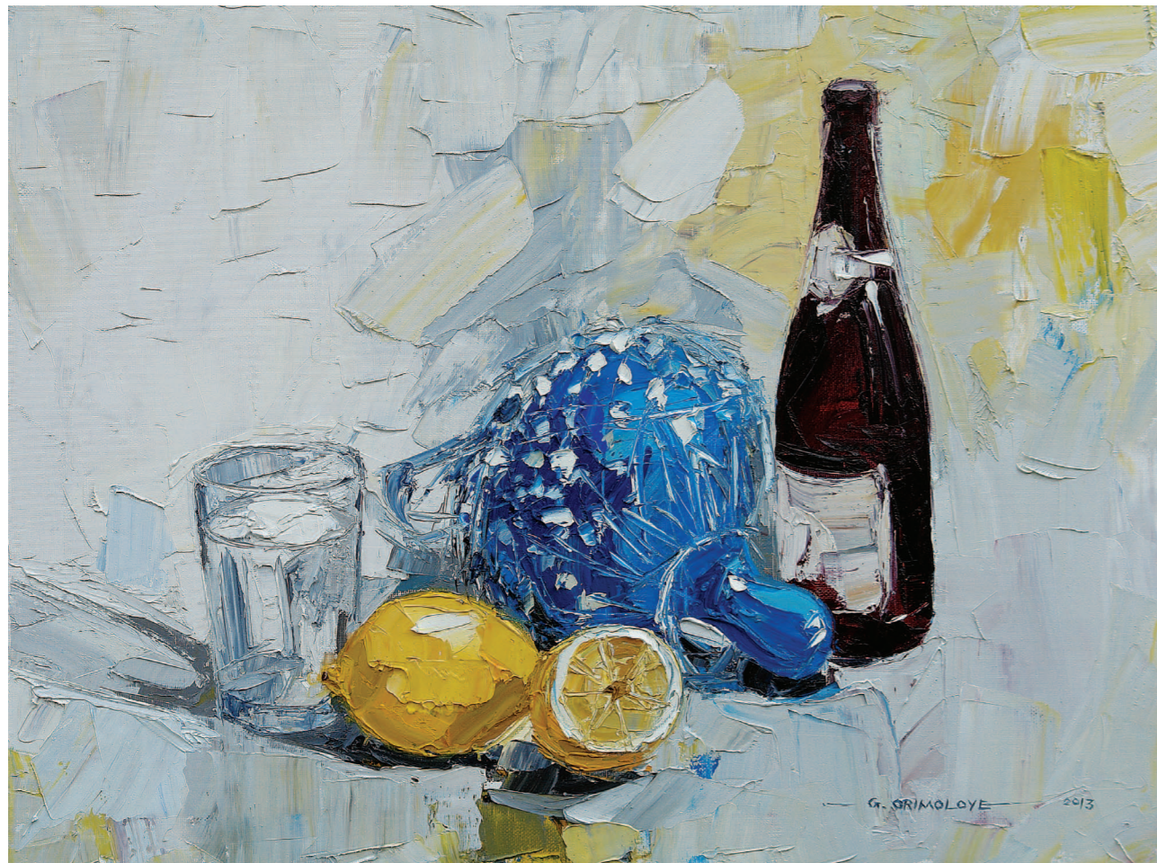
Shekere, lemons and glass of water. Oil on canvas, 2013. 61 x 46 cm