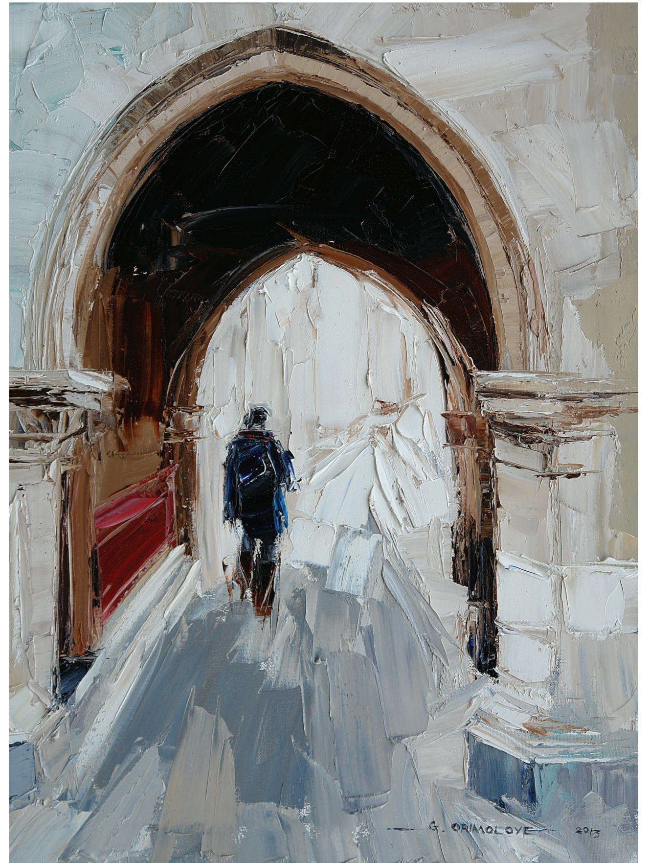
Untitled. Oil on canvas, 2013. 61 x 46 cm