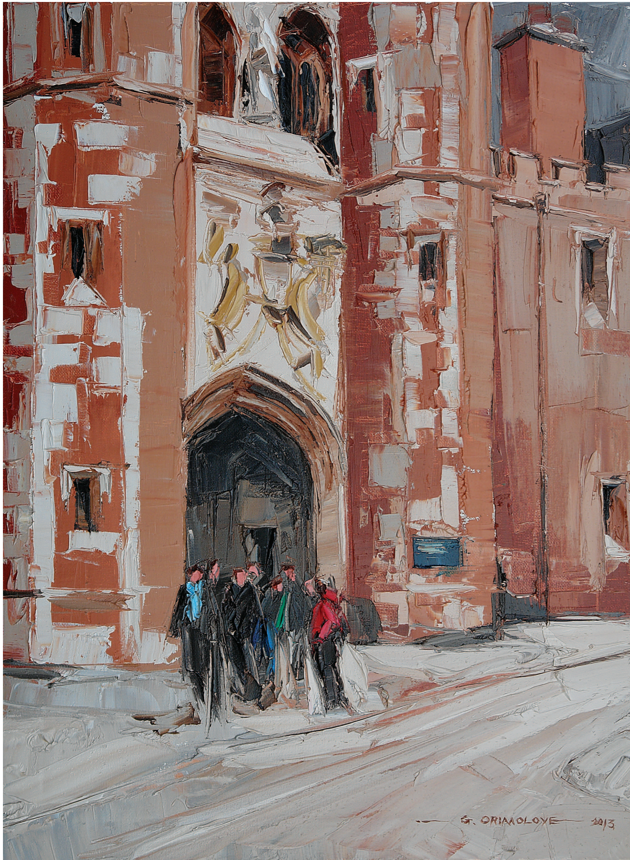
St John's College, Cambridge. Oil on canvas, 2013. 61 x 46 cm