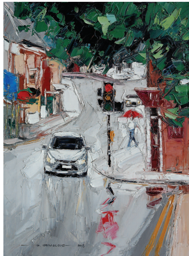
Early Morning Rain, High Street, Saffron Walden. Oil on canvas, 2013. 61 x 46 cm