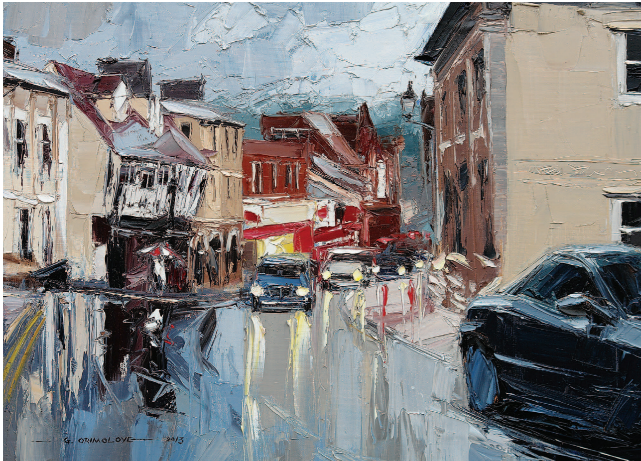
High Street in the rain, Saffron Walden. Oil on canvas, 2013. 61 x 46 cm