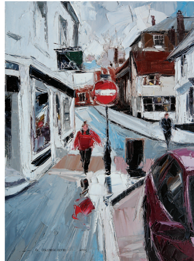
Market Hill (from Market Square), Saffron Walden. Oil on canvas, 2013. 61 x 46 cm