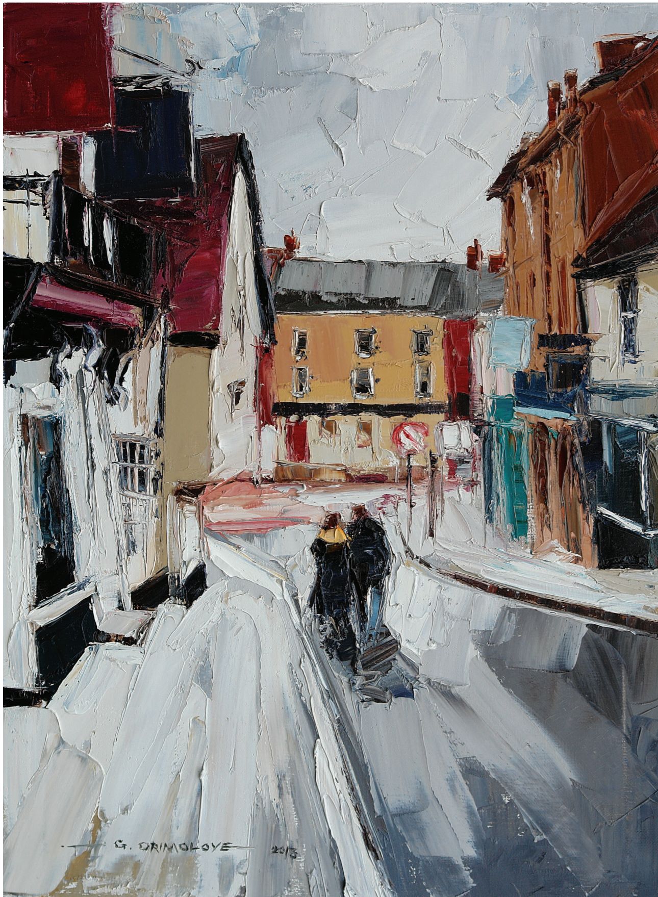
Market Hill, Saffron Walden. Oil on canvas, 2013. 61 x 46 cm