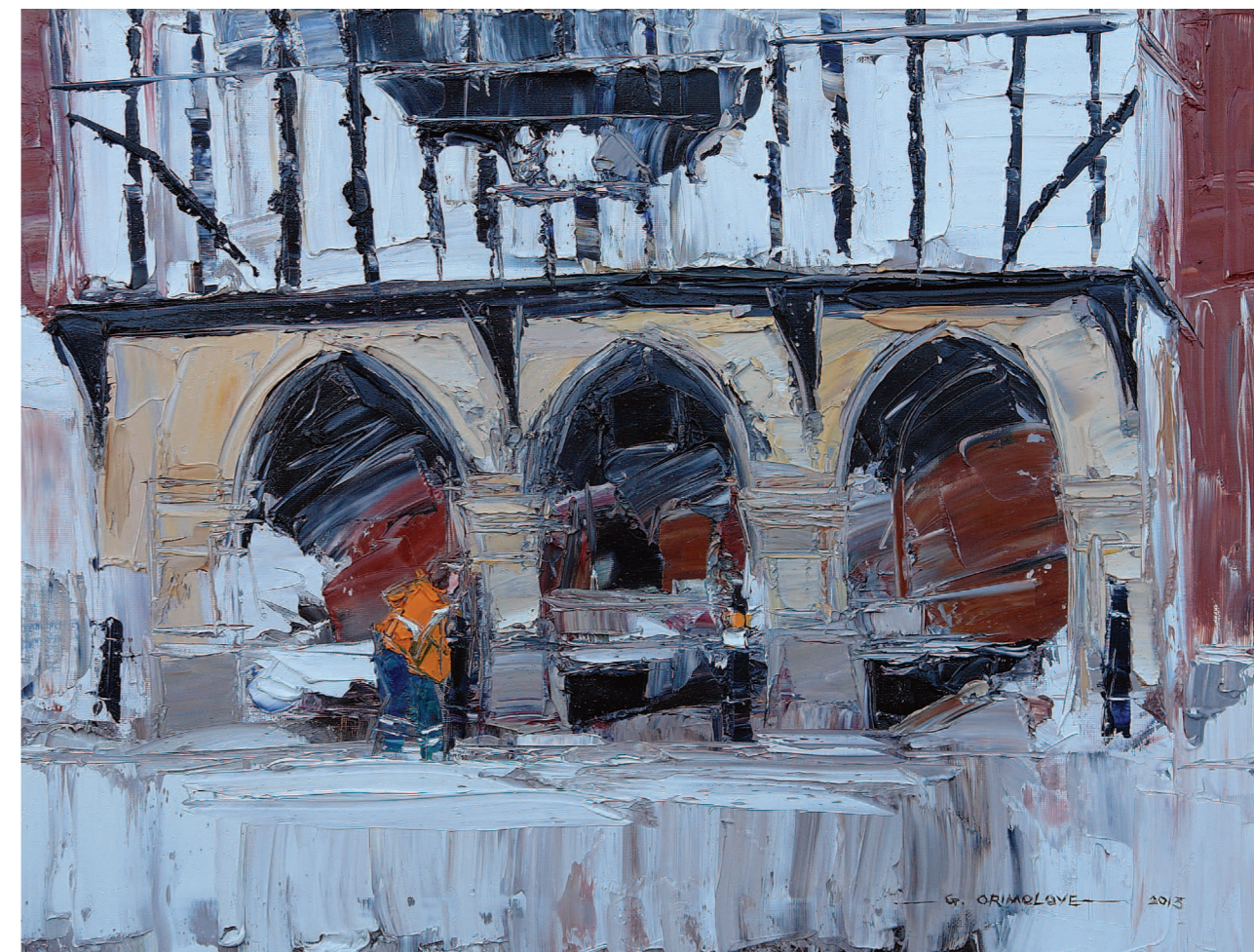
Saffron Walden Town Hall. Oil on canvas, 2013. 61 x 46 cm

Daniel’s interpretation of light and colour is possibly at its most dramatic in his portrait and figure painting when light is used to model forms often with a very strong background colour such as red or green, then a few