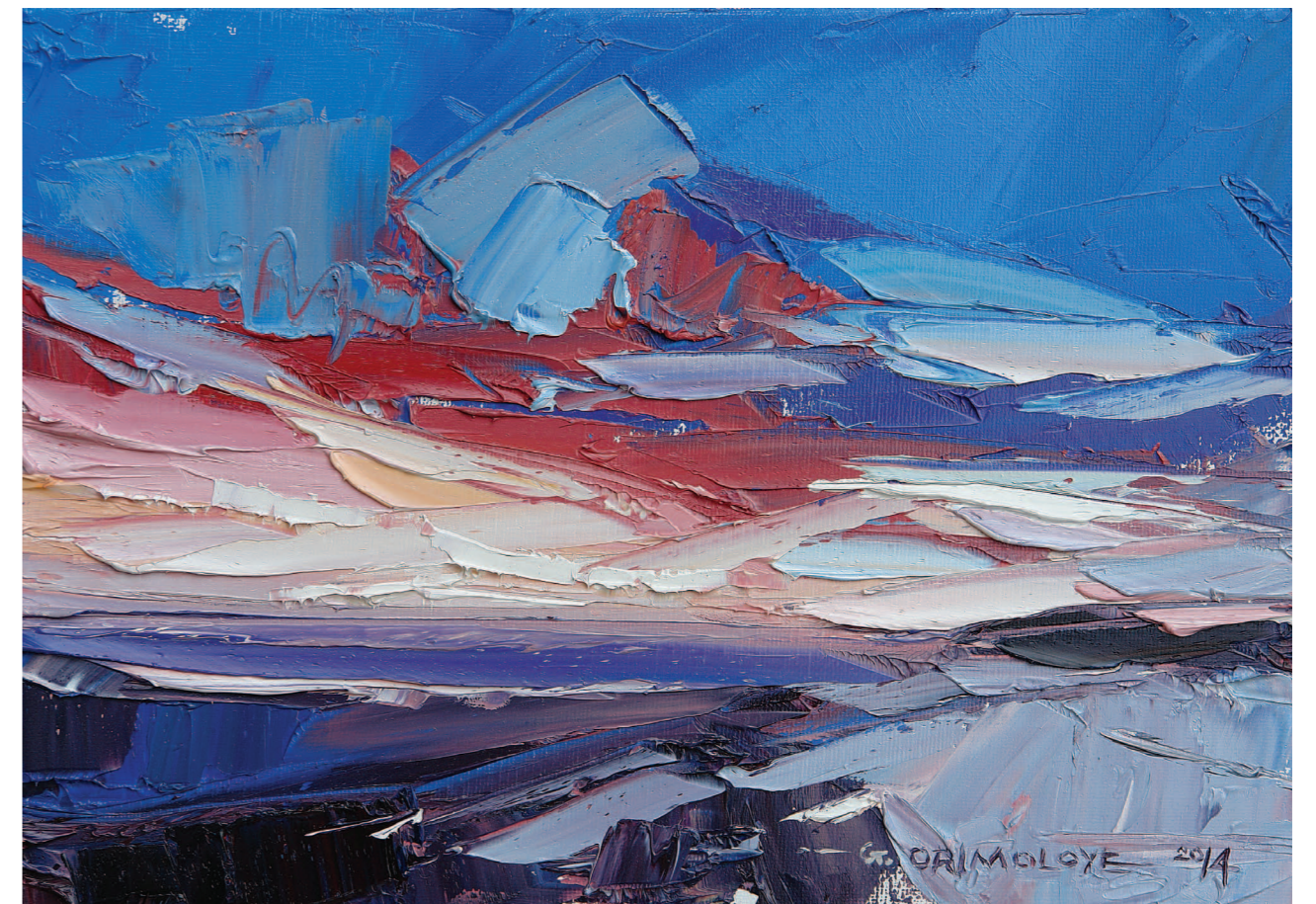
Chesil Beach sunset, Dorset. Oil on canvas, 2014. 36 x 26 cm