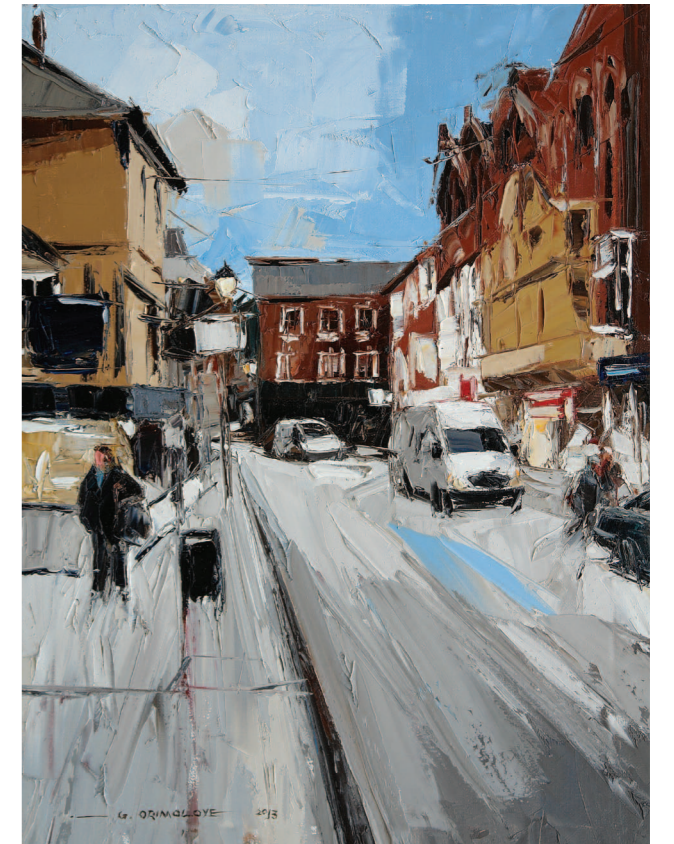
King Street, Saffron Walden. Oil on canvas, 2013. 61 x 46 cm