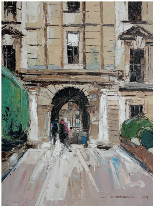
Clare College from The Backs. Oil on canvas, 2013. 61 x 46 cm