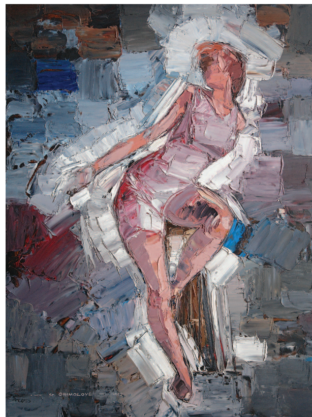
Figure (7). Oil on board, 2012. 82 x 62 cm