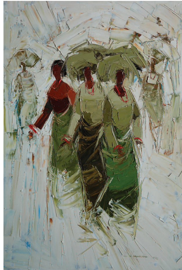
..in green and brown. Oil on board, 2012. 123 x 82 cm