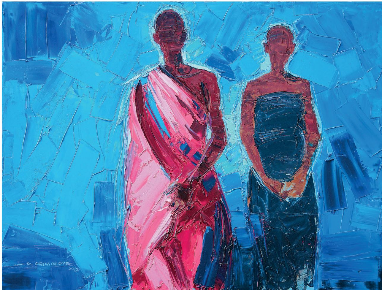
The couple. Oil on board, 2012. 82 x 62 cm