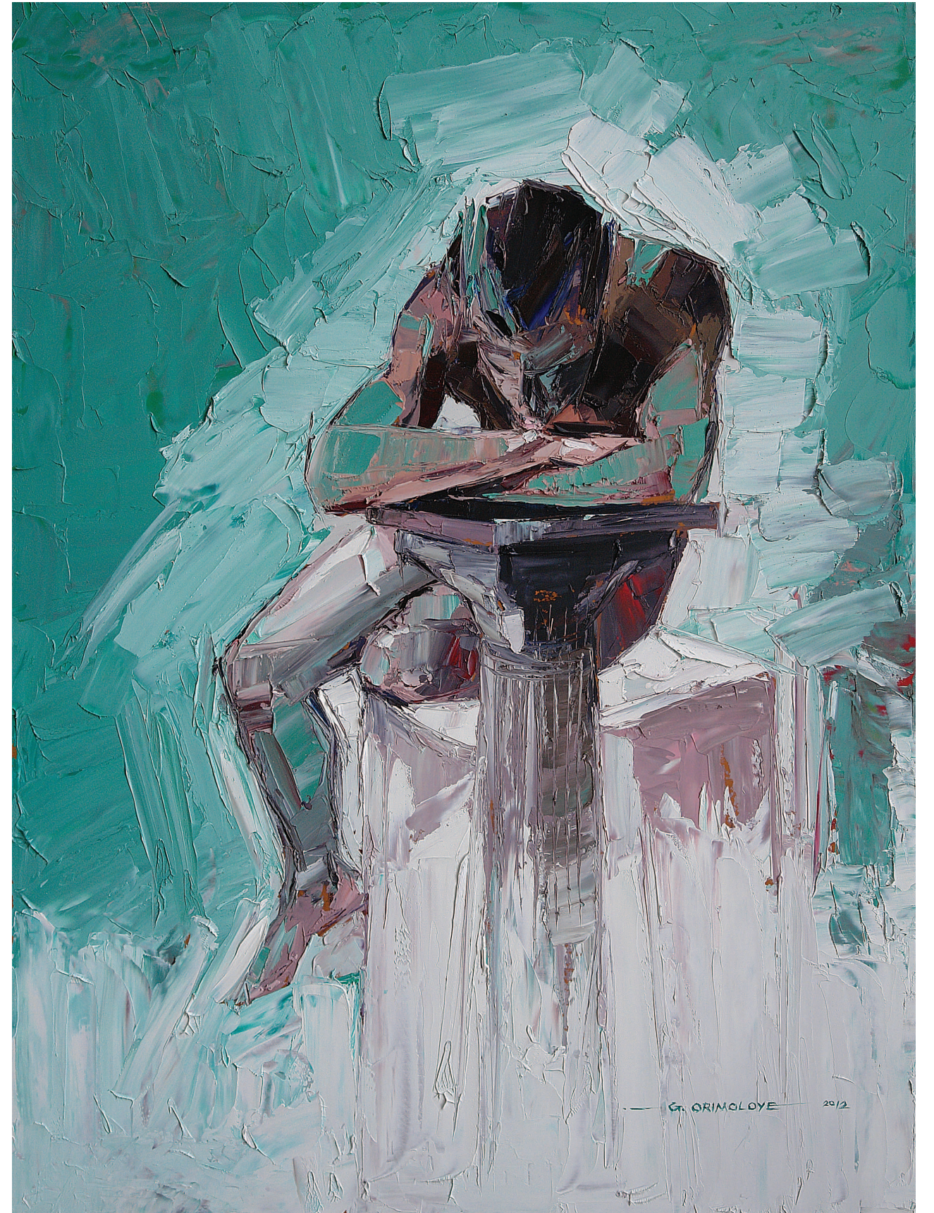
Figure (4). Oil on board, 2012. 82 x 62 cm