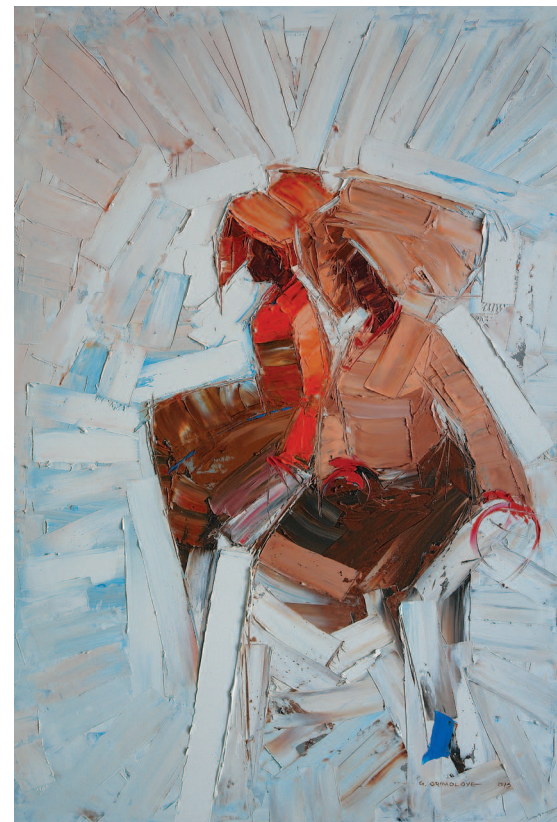
African Women. Oil on board, 2012. 123 x 82 cm