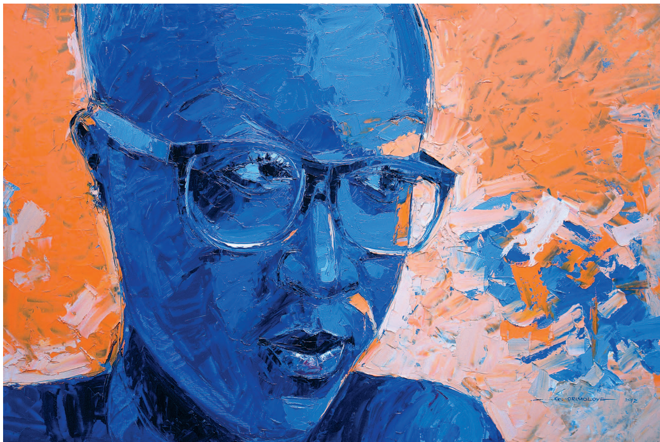
Blue in the face. Oil on board, 2012. 123 x 82 cm