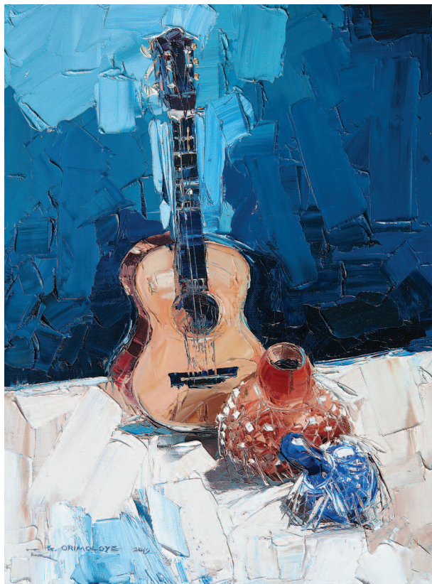
Oil on canvas, 2012. 61 x 46 cm