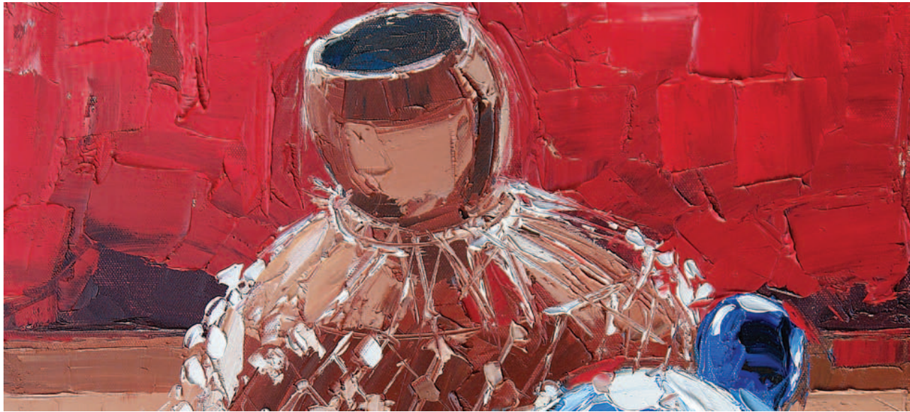
Shekere and glass of water. Oil on canvas, 2012. 61 x 46 cm