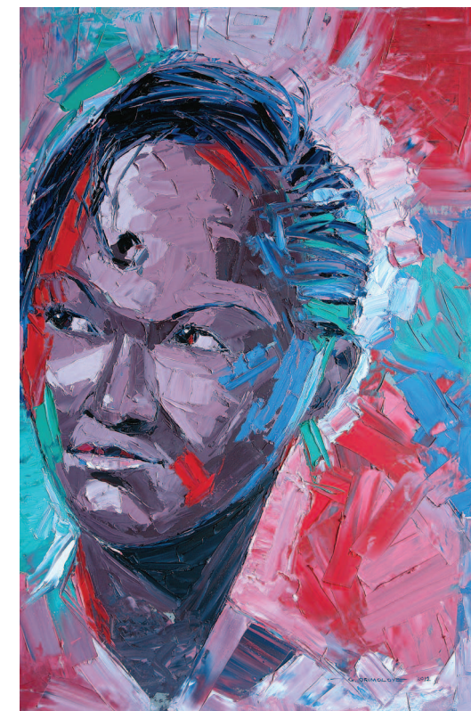
Oju (4). Oil on board, 2012. 123 x 82 cm