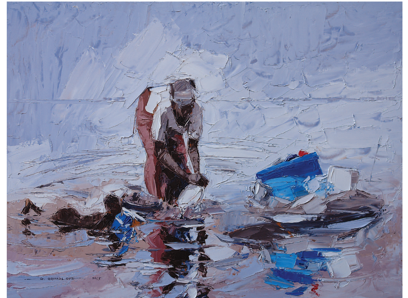
Untitled. Oil on board, 2013. 82 x 62 cm