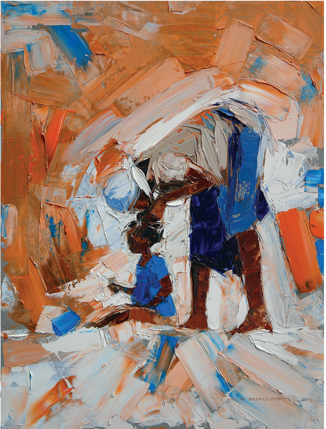
Hairdressing cannot be done via face-book. Oil on board, 2012. 82 x 62 cm