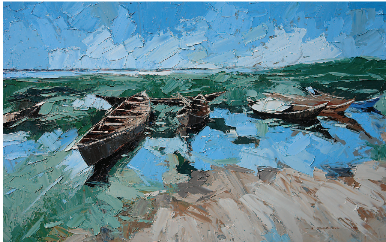
Canoes, weed and lagoon. Oil on board, 2012. 123 x 82 cm