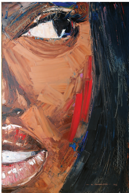
Oju (1). Oil on board, 2012. 123 x 82 cm