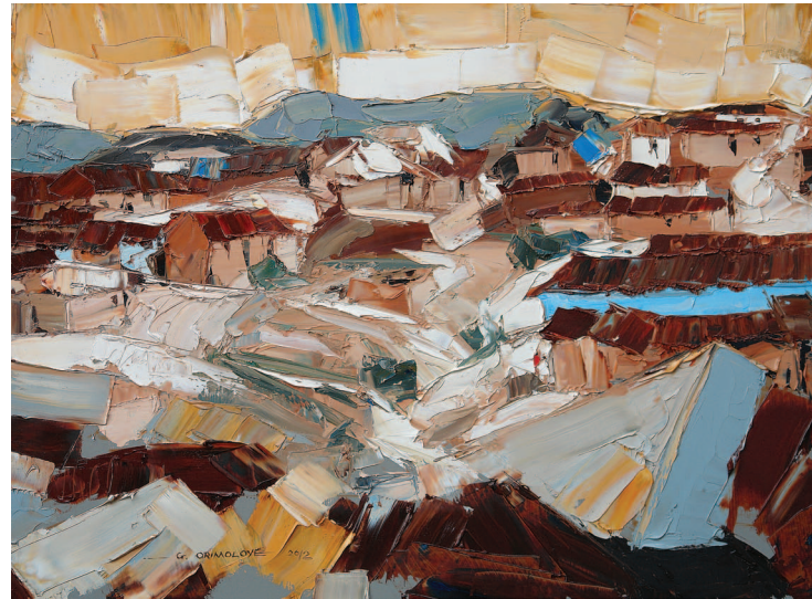
Yellow landscape. Oil on board, 2012. 82 x 62 cm