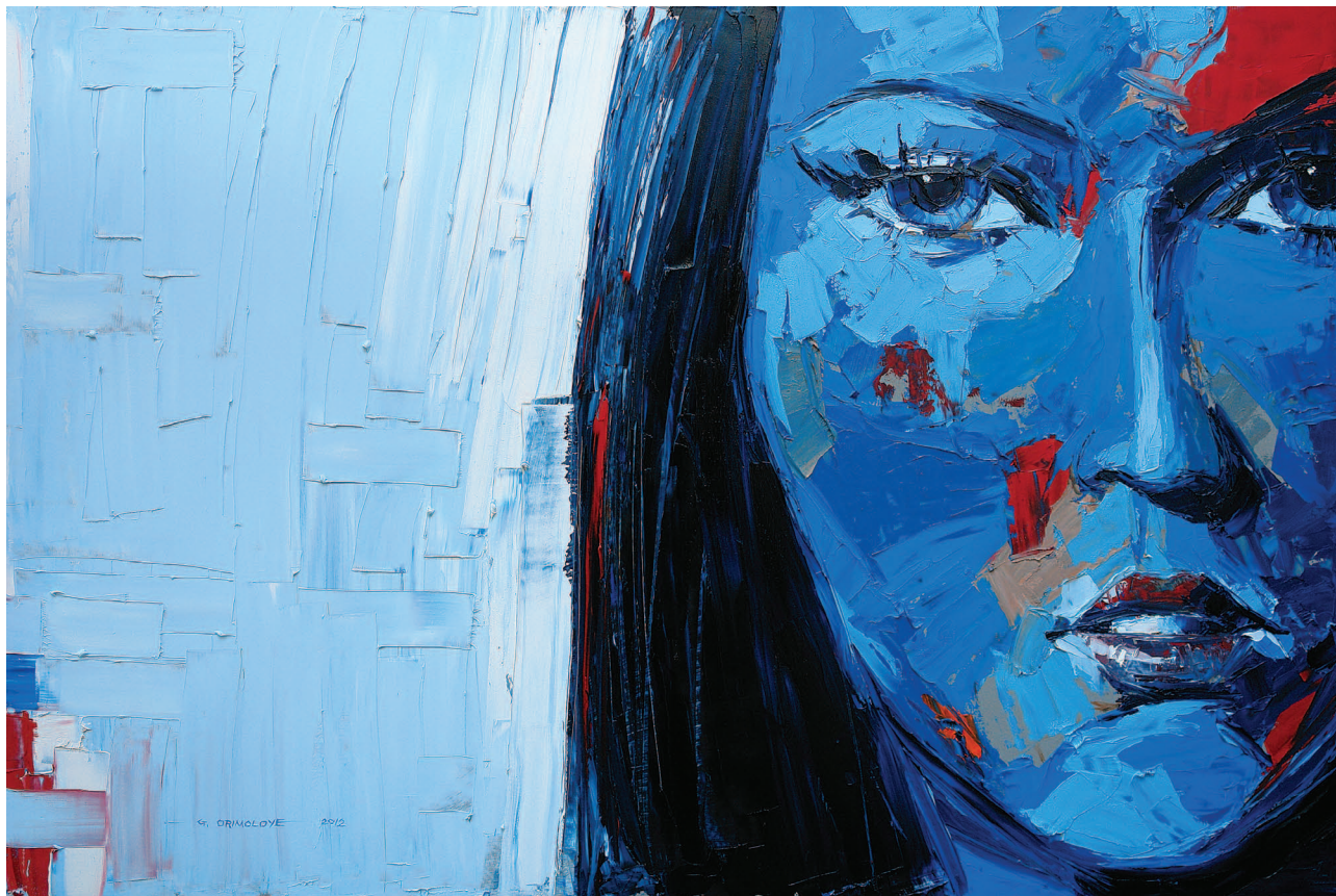
Oju (5). Oil on board, 2012. 123 x 82 cm