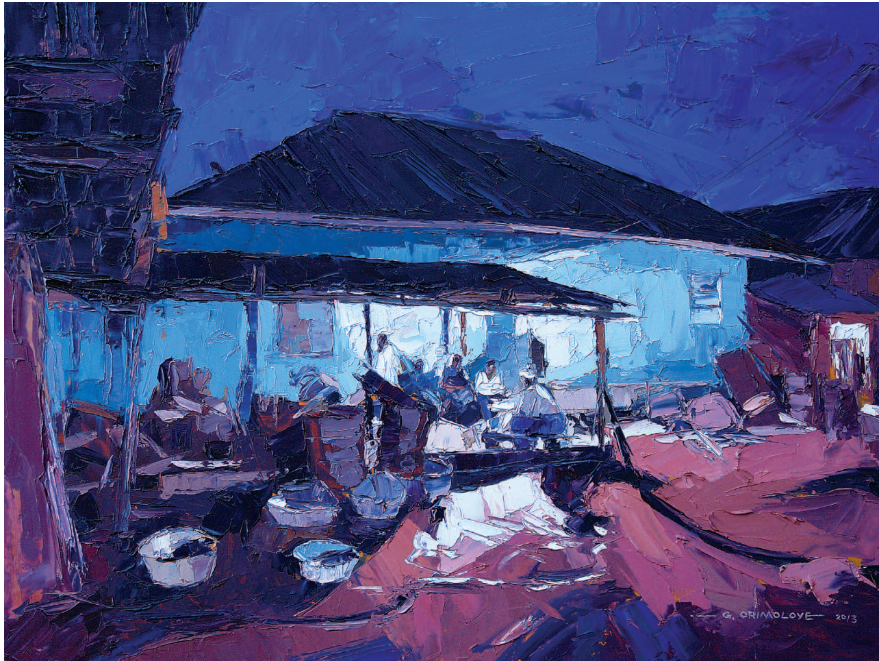
Late evening mood. Oil on board, 2013. 82 x 62 cm.