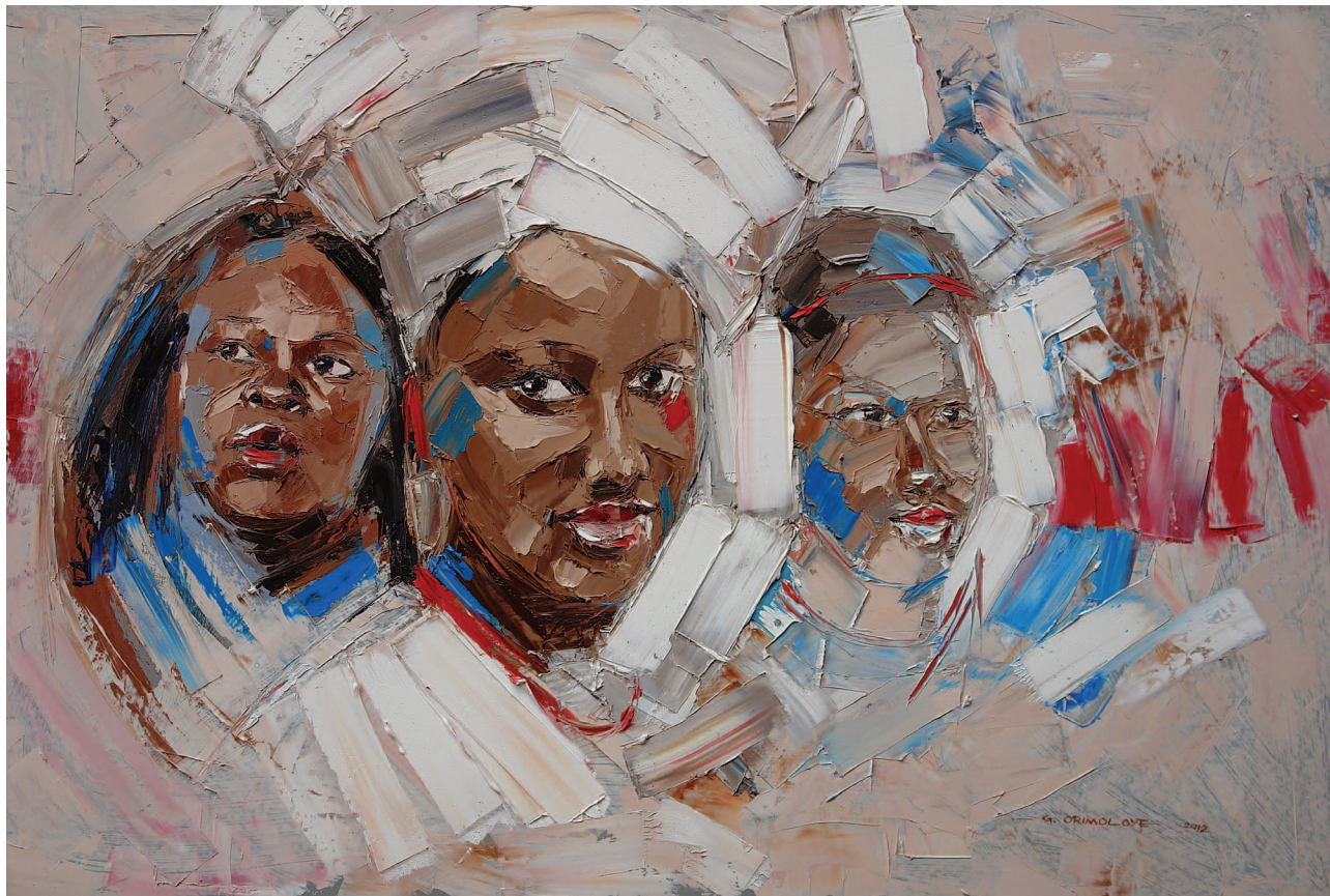
Oju - a composition. Oil on board, 2012. 123 x 82 cm