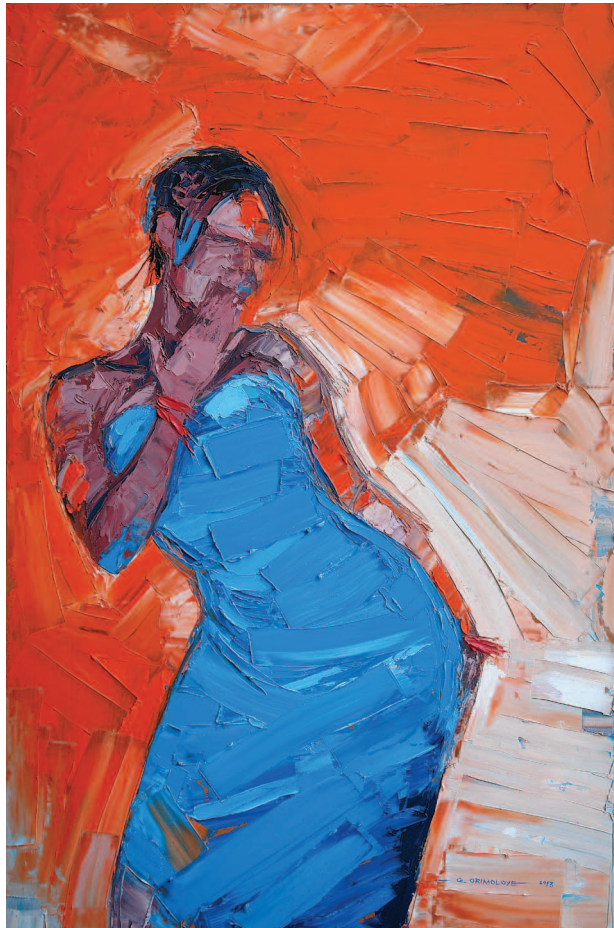
Girl in blue dress. Oil on board, 2012. 123 x 82 cm