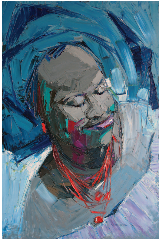
Oju (2). Oil on board, 2012. 123 x 82 cm