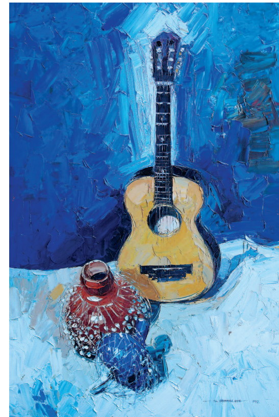
My shekere and my daughter's guitar (2).