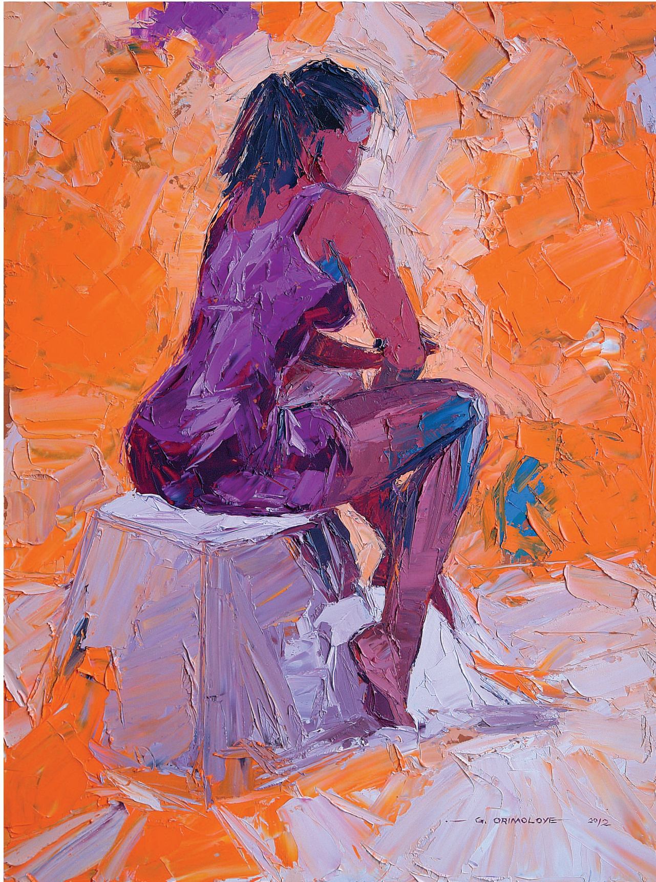
Figure (3). Oil on board, 2012. 82 x 62 cm