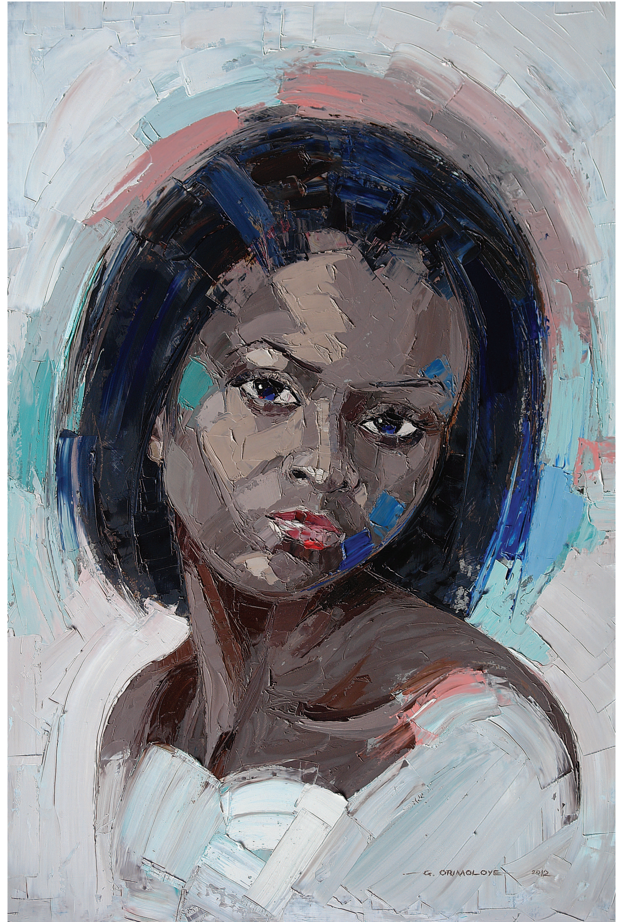
Oju (6). Oil on board, 2012. 123 x 82 cm