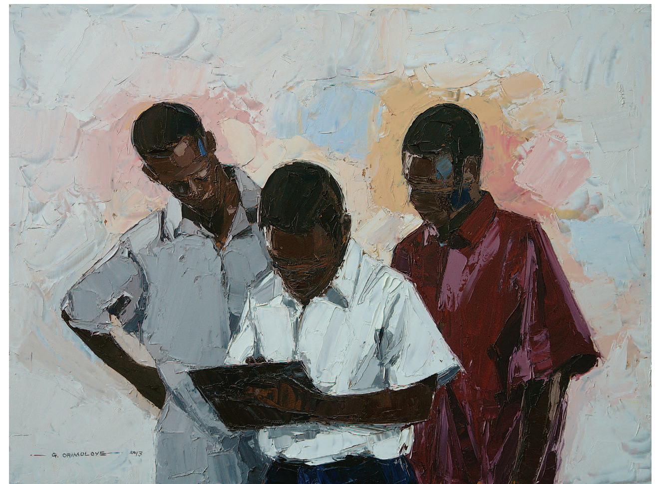
Social networking. Oil on board, 2013. 82 x 62 cm