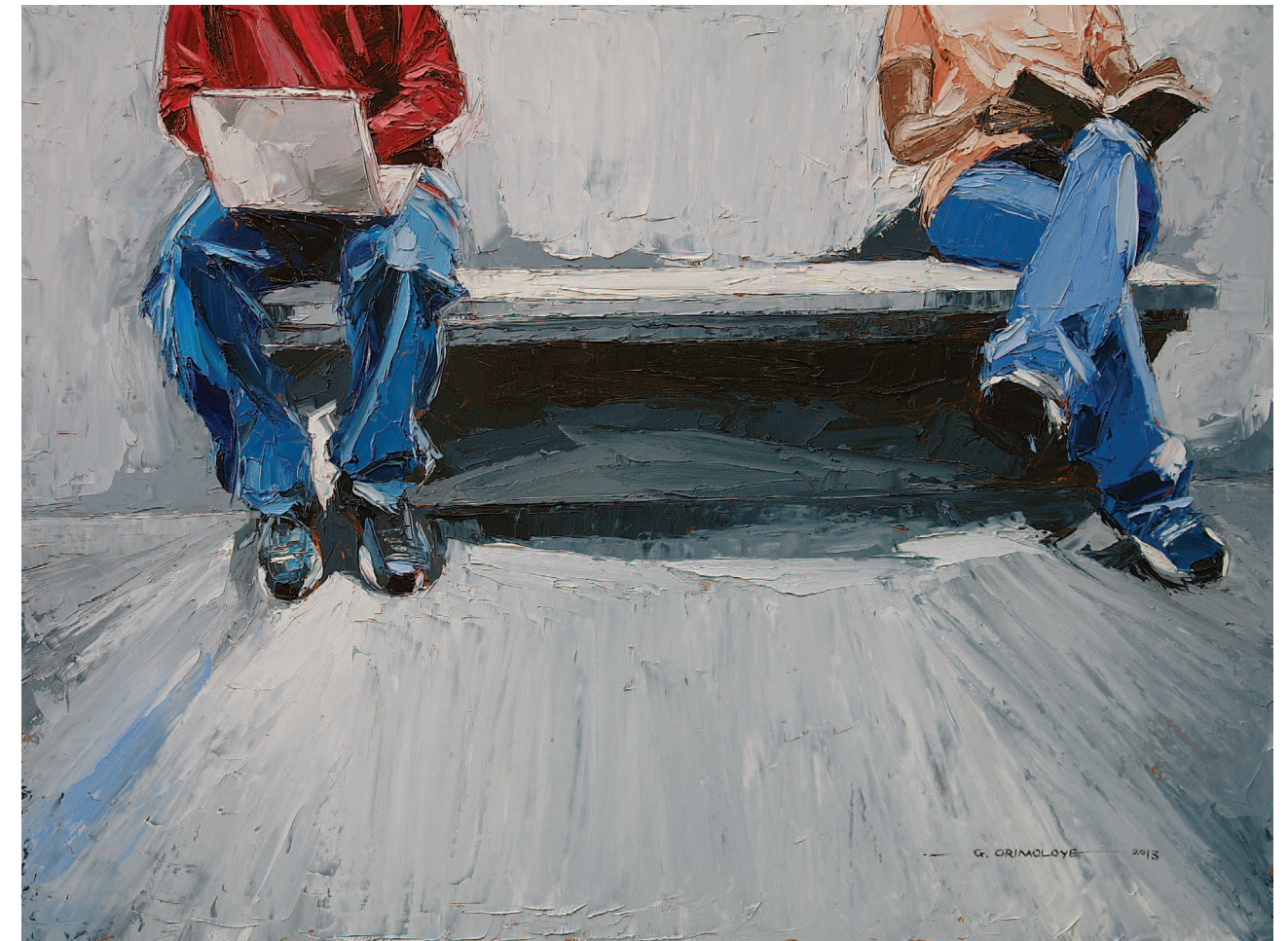
Face-book and Realbook Oil on board, 2013 82 x 62 cm.