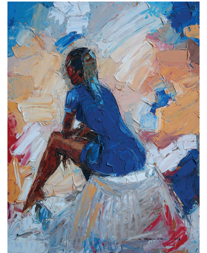
Figure (1). Oil on board, 2012. 82 x 62 cm