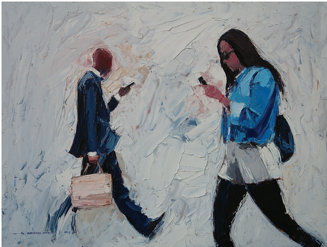
Face-booking while walking. Oil on board, 2013. 82 x 62 cm