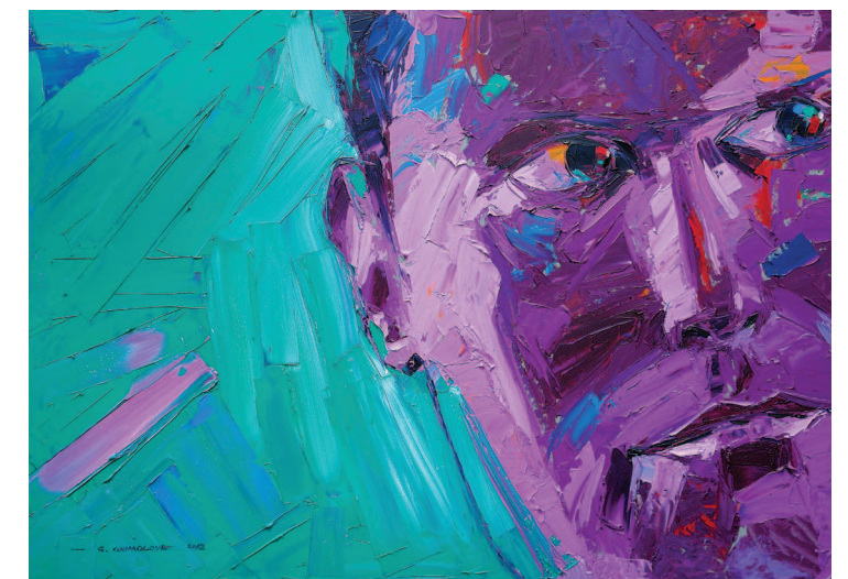
Oju (3). Oil on board, 2012. 123 x 82 cm