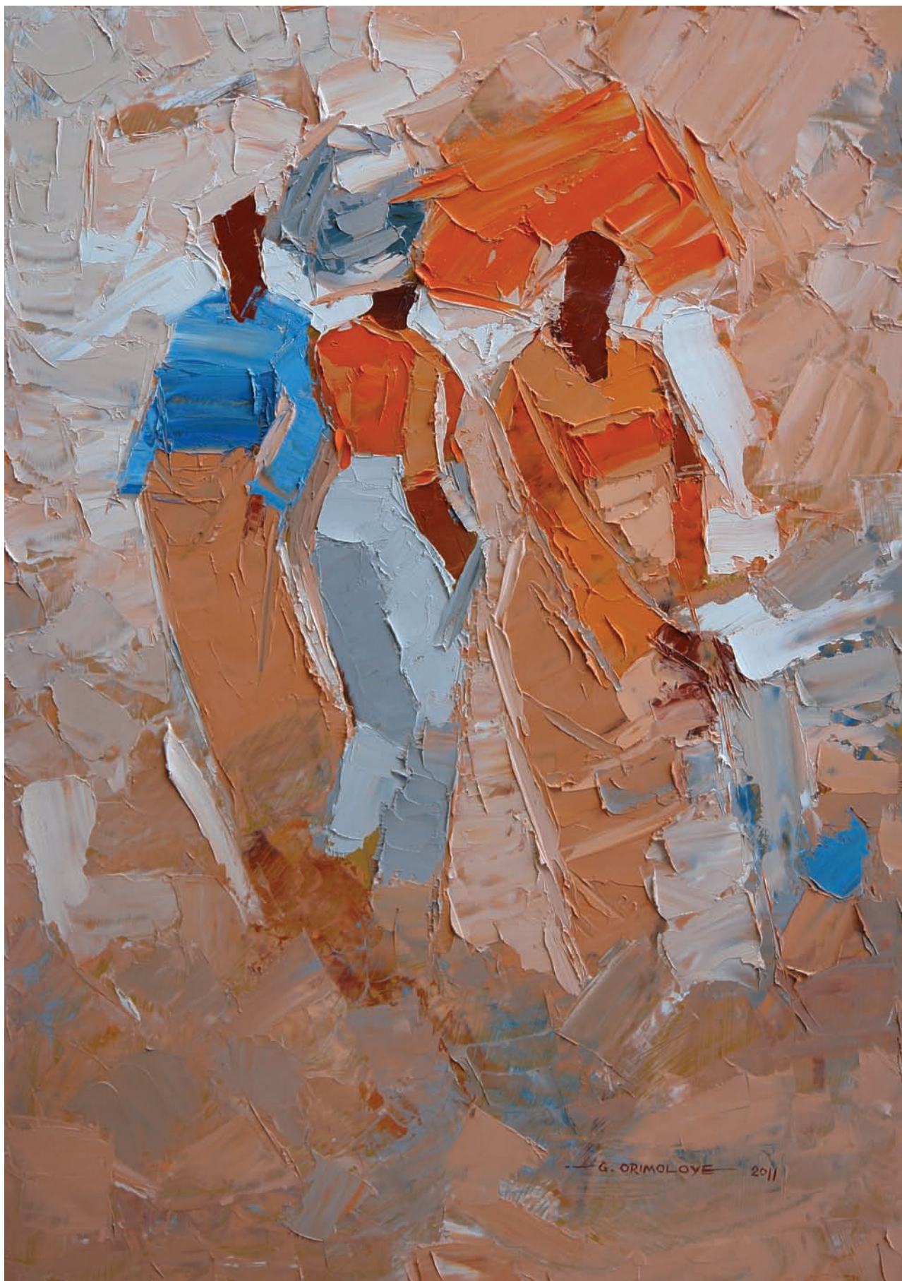
Stepping out Oil on board, 2011 88 x 61 cm.