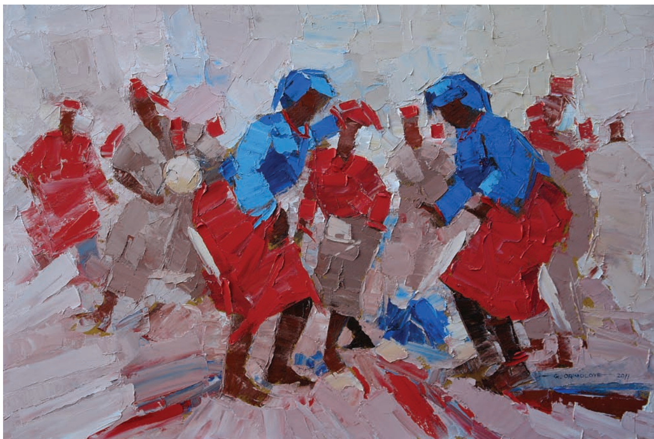
Feelings of the dance Oil on board, 2011 123 x 81 cm.