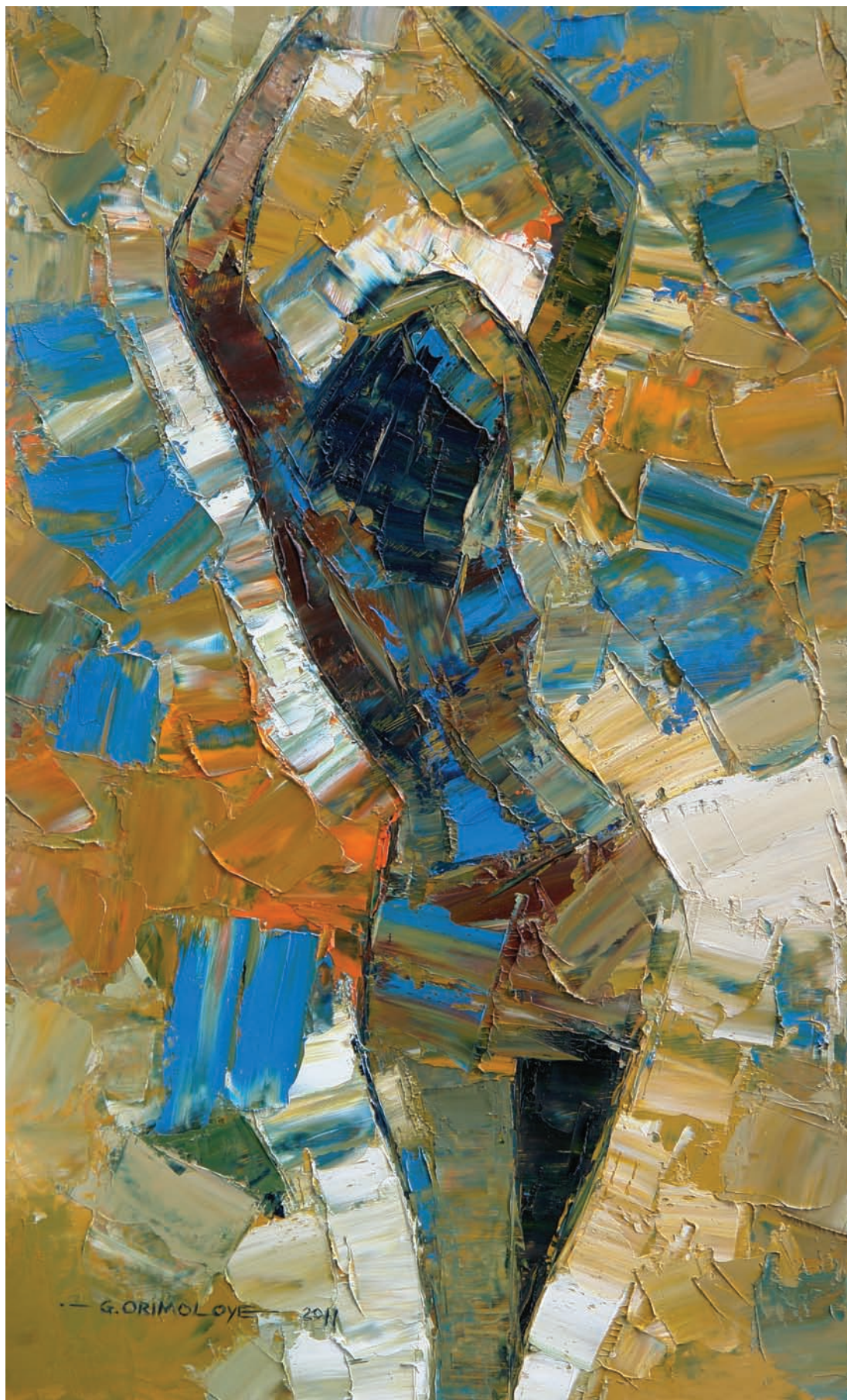
Figure in oil Oil on board, 2011 61 x 37 cm.