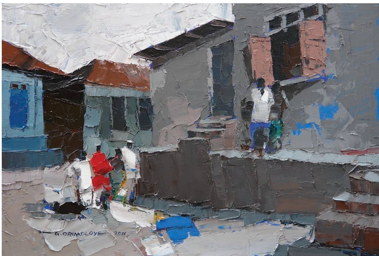
At home (1) Oil on board, 2011 62 x 40 cm.