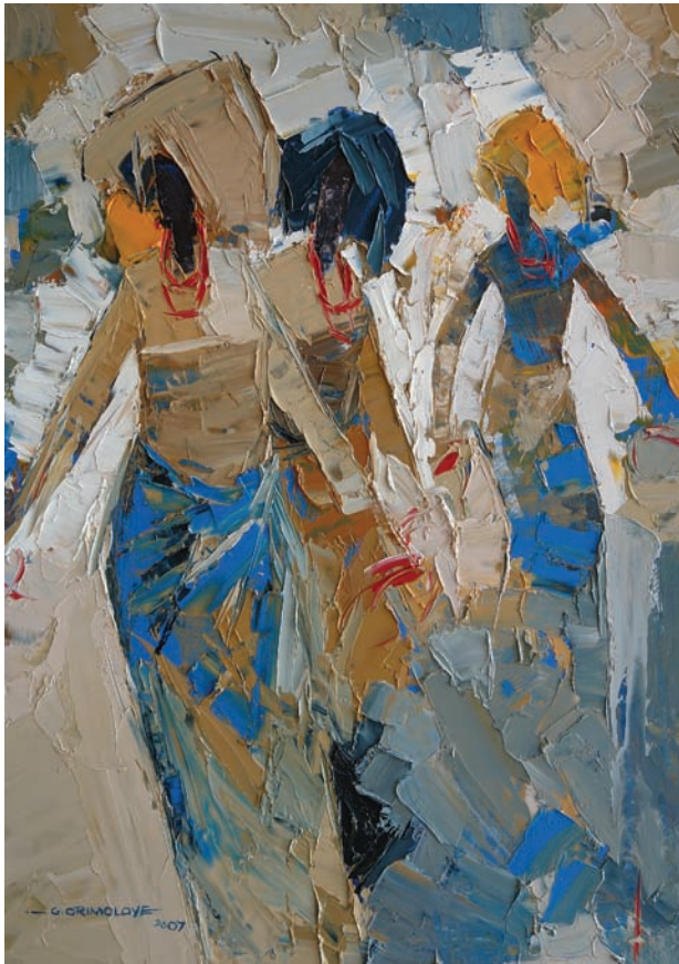
Elegantly dressed Oil on board, 2007 82 x 63 cm.