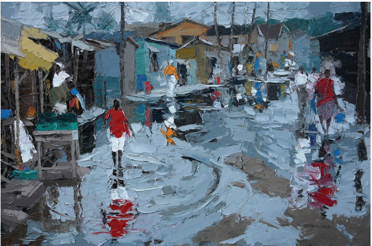
After the morning showers Oil on board, 2011 123 x 81 cm.