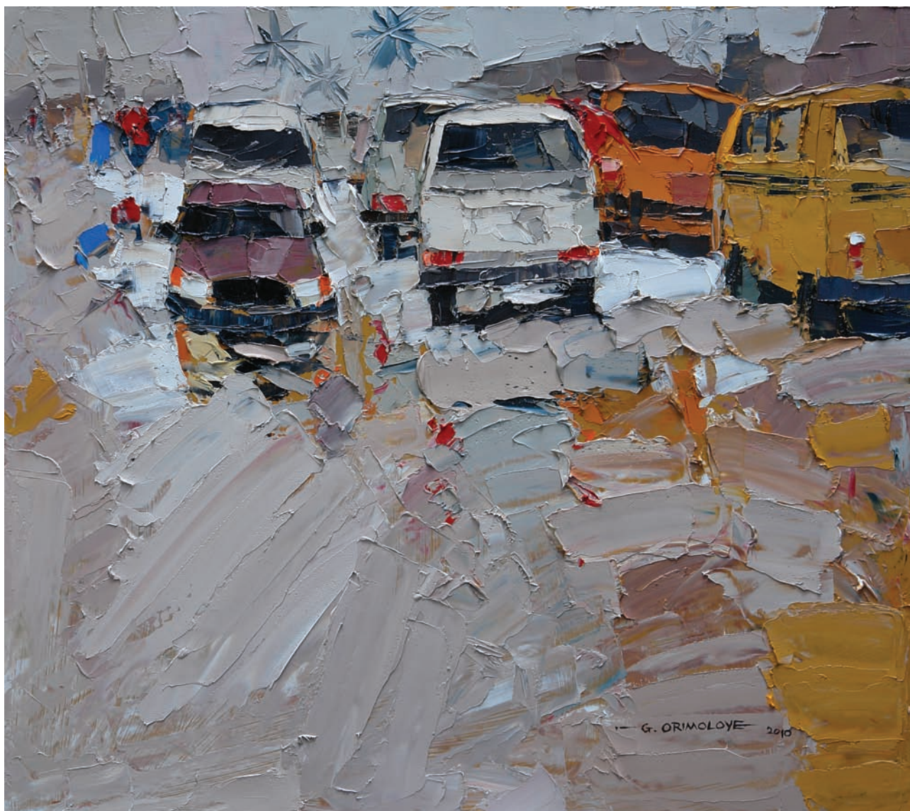
Omo danfo Oil on board, 2010 69 x 62 cm.

Former President, Society of Nigerian Artists.