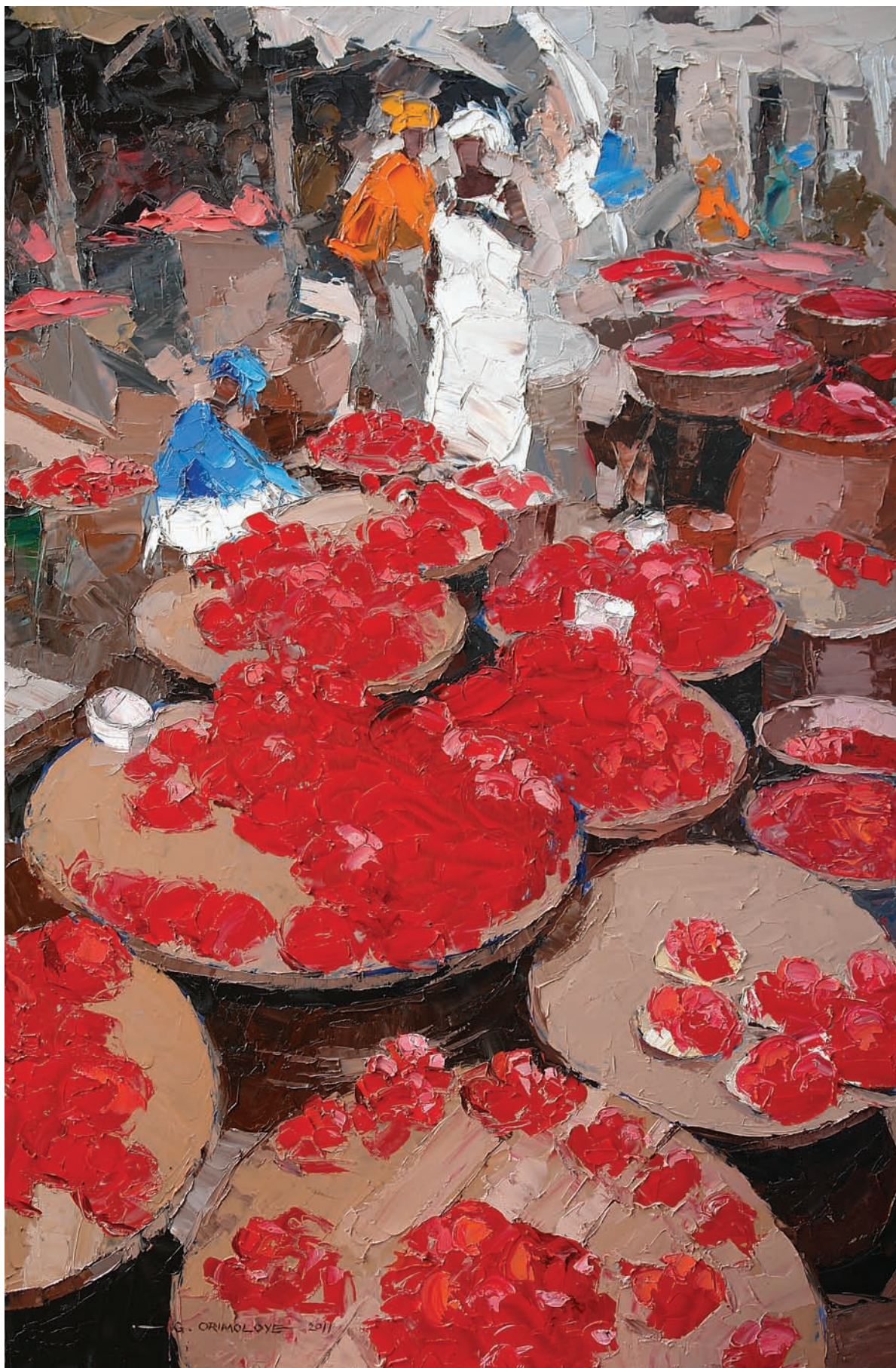
Elo ni tatase Oil on board, 2011 123 x 81 cm.