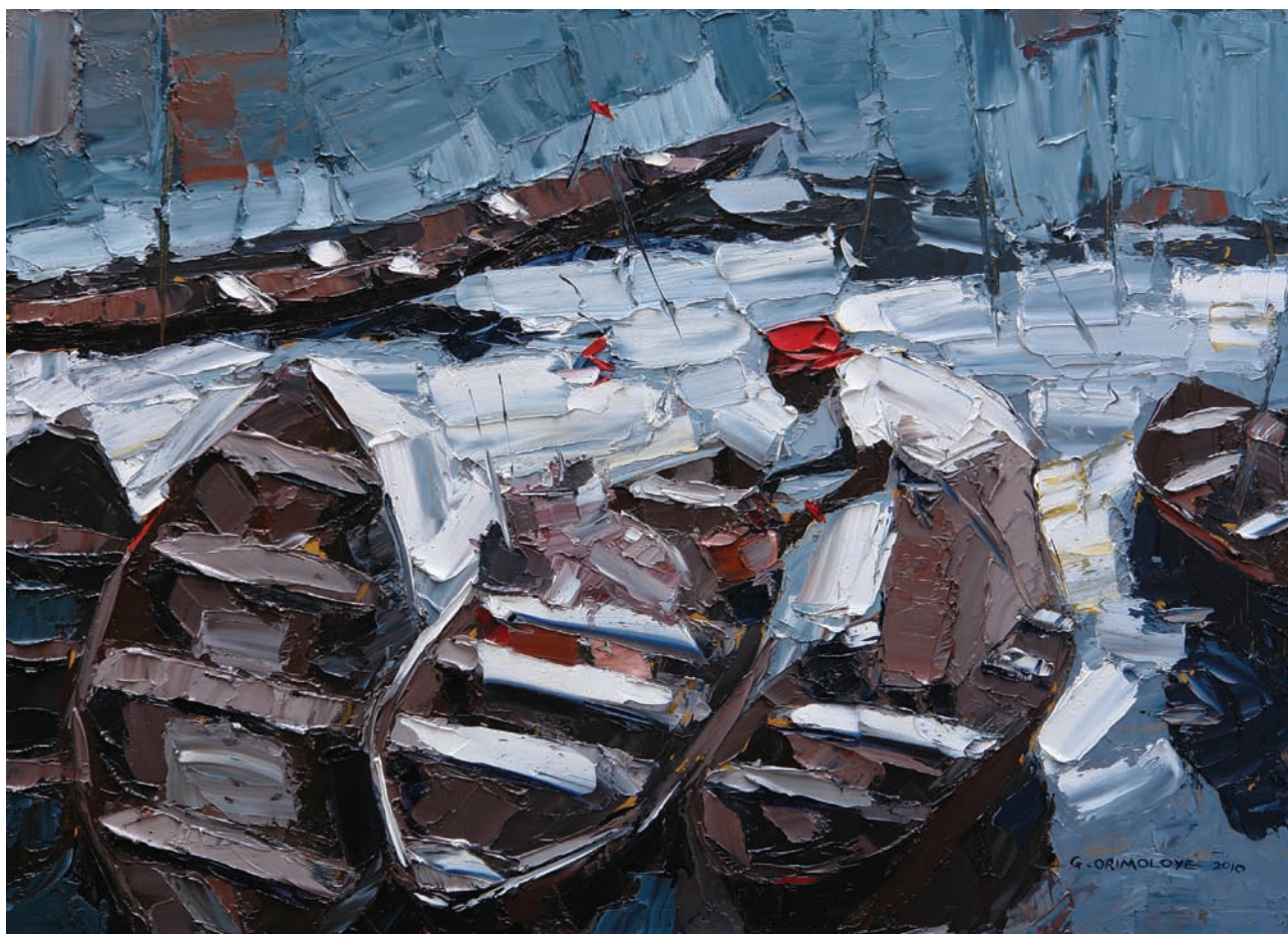
Inspecting the day's catch Oil on board, 2010 85 x 62 cm.