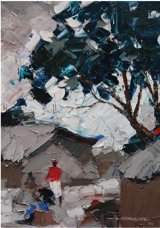
At home (2) Oil on board, 2011 60 x 40 cm.