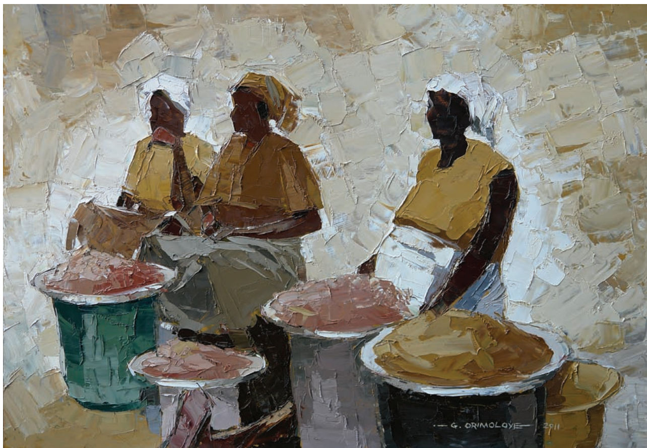
Market composition Oil on board, 2011 86 x 61 cm.