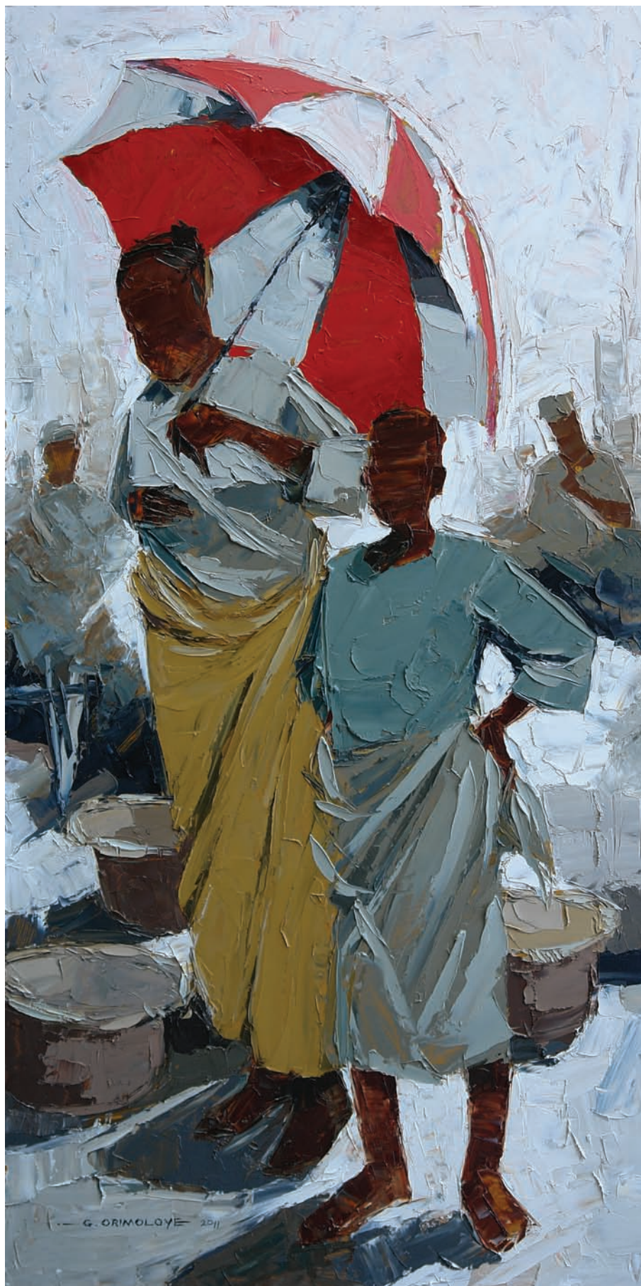
Girl, mother and umbrella Oil on board, 2011 123 x 61 cm.