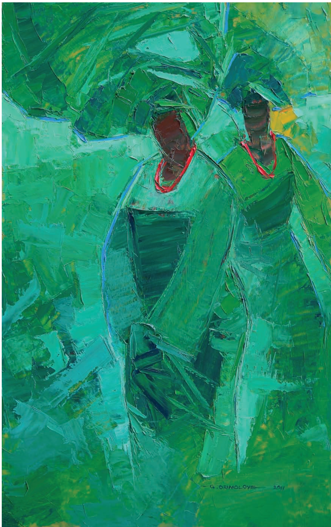
Elaborately tied green gele Oil on board, 2011 98 x 61 cm.