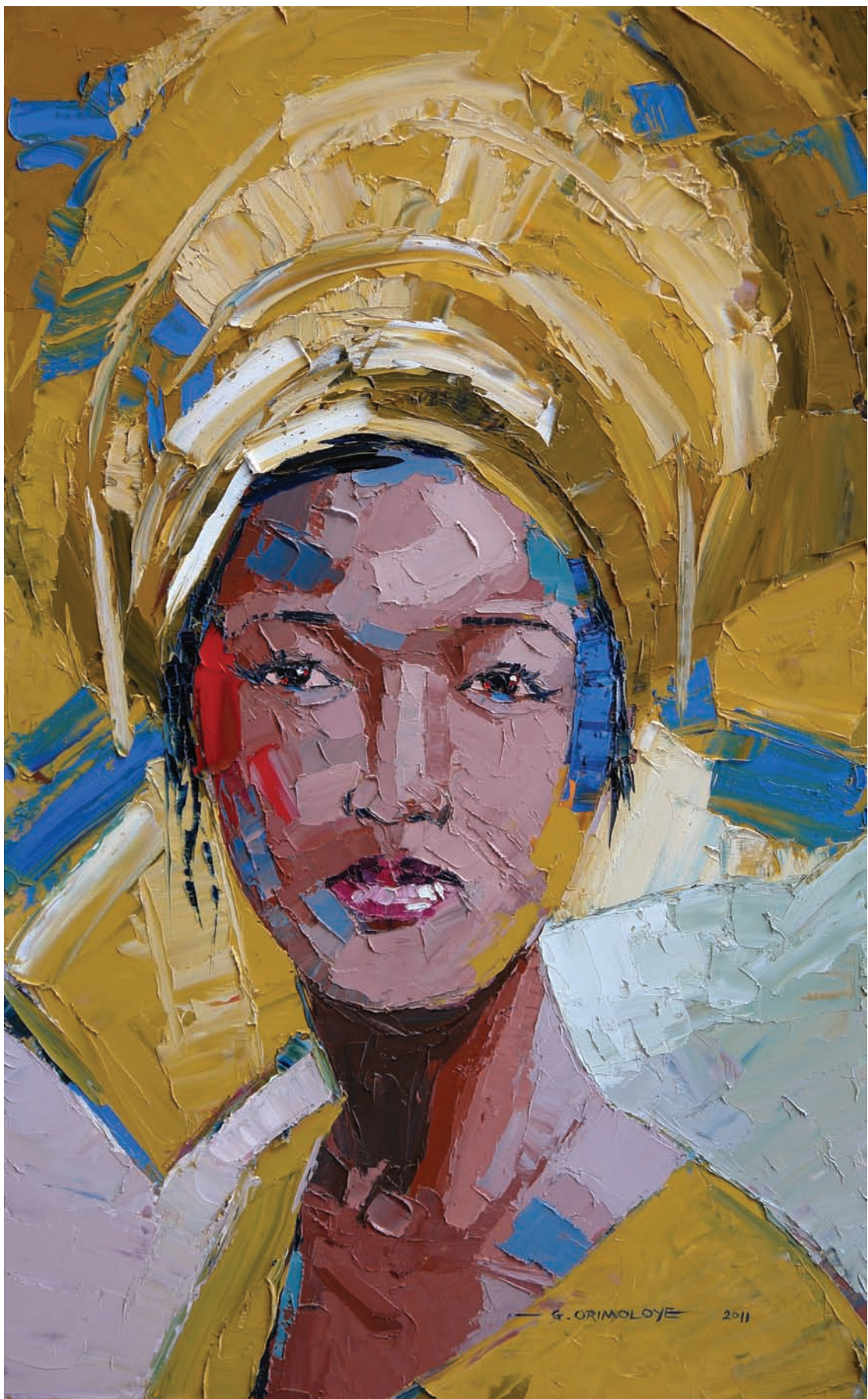
Girl in yellow gele (Iwa le wa genre) Oil on board, 2011 100 x 61 cm.