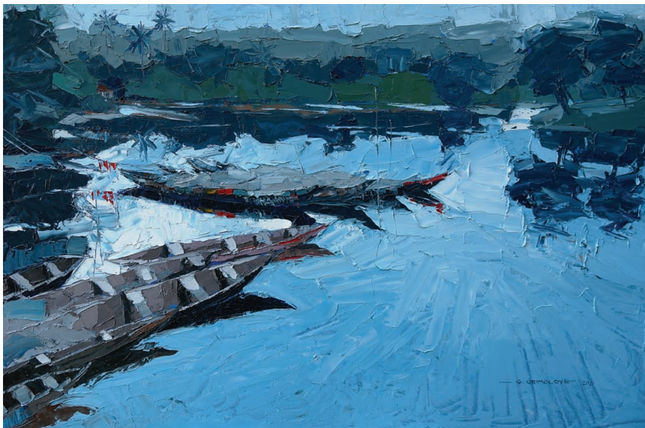
Canoes on the creek (1) Oil on board, 2011 123 x 81 cm.