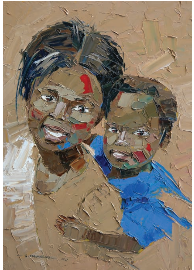
Egbon ati aburo Oil on board, 2011 83 x 62 cm.